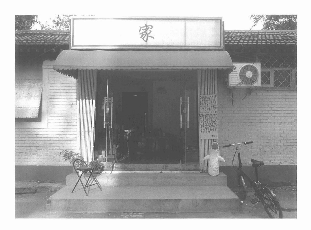
Layer of space | viewings private (home), public (corporate), and private-becoming-public (HomeShop)

Two of the most prominent features of contemporary Olympic spectacles were both introduced in conjunction with the Berlin Summer Games of 1936: the invention of the torch relay as an exhortation toward a strong German fatherland and the introduction of live television viewing areas around Berlin, both of which leveraged some of the most innovative media technologies of the day to help entwine the sporting events with the National Socialist Party's quest for power. And, though such media coverage has transformed dramatically from its humble beginnings in 1936 Berlin to the audiovisual feast on display at the 2008 Summer Olympics in Beijing, the basic premise of public viewing areas and the underlying desire to streamline a burgeoning nationalism have remained largely the same.