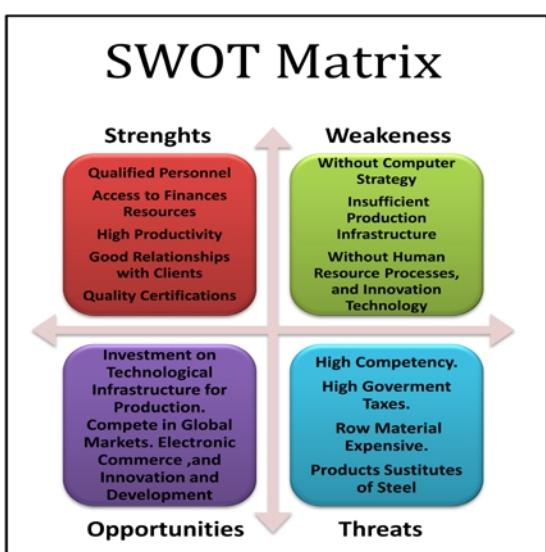
Figure 1: SWOT Matrix

The Figure 2 shows the main components of the proposal model, where three components are associated to form the strategic alignment model, these are: Key business processes, ICT's, and enterprises architectures like a driver where all components will be integrated.