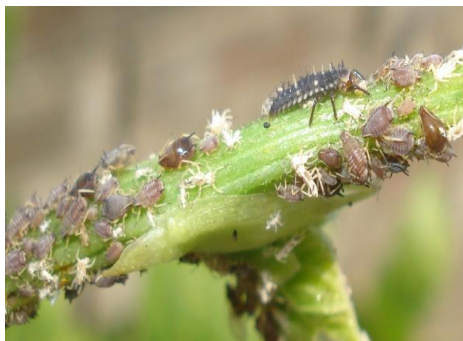
Fig. 1: Larva feeding on A. craccivora