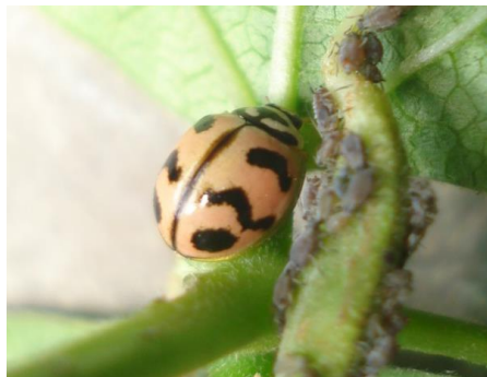
Fig. 2: Adult feeding on A. craccivora

In the present study, it was also observed that the 4 th instar grubs consumed more aphids per day than the other instars and adults when feed on A. craccivora , A. gossypii and L. erysimi . Pirsanna et. al. (2013) has also reported that the 4 th instar grubs consumed significantly more aphids when compared to 1 st , 2 nd and 3 rd instars per day. Similar observation has been also made by Babu (2001) and Ali & Rizvi (2007) on C. sexmaculata and C. septempunctata respectively.