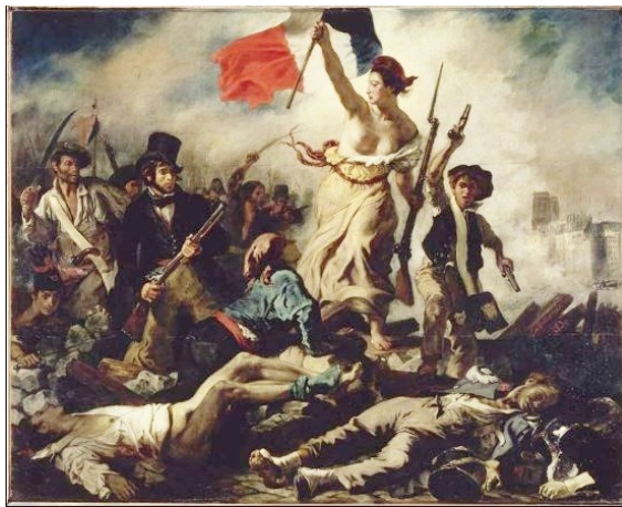
Eugène Delacroix, July 28: Liberty Leading the People , 1830, oil on canvas, approximately 11.8 x 8.2 feet. (Louvre, Paris)