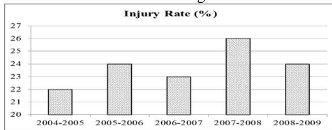
Figure-1 Yearly Injuries Trends in Coal Workers of Baluchistan

The trends in injuries due to occupation especially in underground mines are more pronounced and prominent in Baluchistan than the other mining countries. The comparison between Baluchistan and U.S.A has been given in table-7. It clearly shows that Baluchistan was leading in all steps of mining and this was just because of negligence from all stake holders. No one was ever bothered to force the mine owners to import the new mining and mine safety equipment, adaptation of new mining techniques, installation of coal dust and gases control devices or just to ensure the safety measures. If only pay and other allied benefits were increased, the working hours of coal workers would automatically reduce and resultantly, the injury rate would decline. The above mentioned statistics can also be represented in graphical shapes in Figures-1 and 2 whereas overall injuries trends in Baluchistan coal mines has been shown in Figure-3