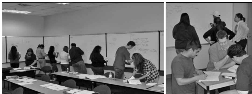
Figure 1. Thayer Method class activities.

This interactive and engaging class format allows for student recitation under the watchful eye of the instructor, offering students opportunities to develop their oral and written communication skills in a low stress environment. Figure 1 illustrates typical class activities using the Thayer Method. The lab program is also directly integrated and synchronized with the class, using the same instructor for each lab and class section. This approach has the synergistic benefit of enabling instructors to incorporate chemical demonstrations which link classroom topic discussions to the laboratory experiment.