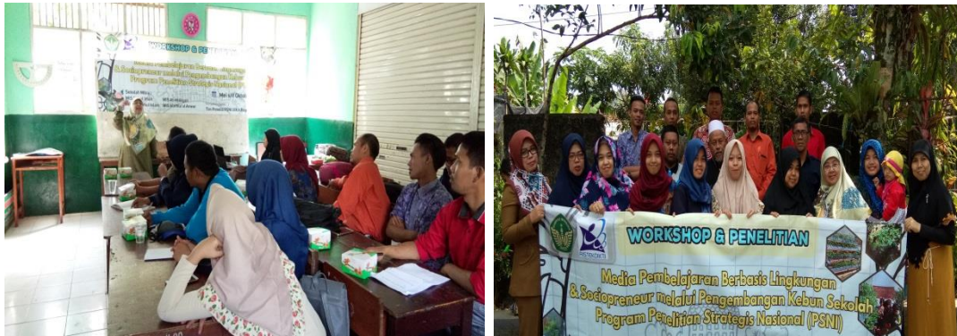
Picture 3. Workshop and Learning

This is in accordance with Law No. 12 of 2012 article 1 paragraph 9 that lecturers must carry out the University Three Dharma namely carrying out educational activities, research and dedication and guidance of the competence of teacher is an effort to educate the nation. In addition to government regulations no. 19 of 2005 concerning national education standards that education personnel must have pedagogical competencies including: 1) teacher's understanding of students, 2) design and implementation of learning, 3) evaluation of learning outcomes, and 4) development of students to actualize their various potentials.