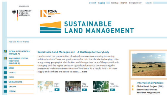
Figure 1: Website of the funding measure „Sustainable Land Management“ (cf. http://nachhaltiges-landmanagement.de/en/ )