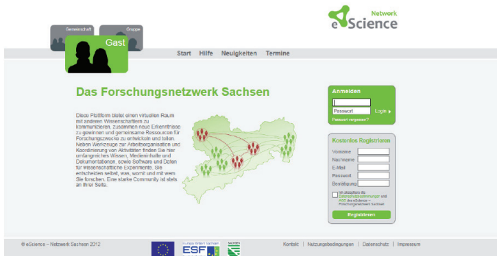
Figure 3: Organizational structure of the eScience – Research Network (cf. https://escience.htwk-leipzig.de/ )

The situation is similar in the case of the research network eScience Saxony. The project eScience – Forschungsnetzwerk Sachsen ( http://www.esciencesachsen.de ), which is a joint project, with funding by the European Social Fund, of all the 12 state universities in Saxony, coordinated by the TU Dresden, the TU Bergakademie Freiberg, and the HTWK Leipzig.