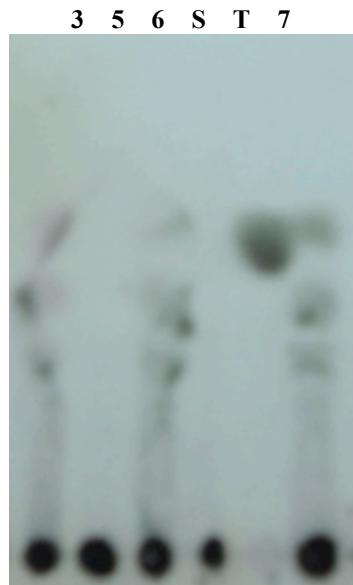
Figure 2. Visualization of MTSase and MTHase catalysis reaction products by TLC (3: ĐT1 ; 5: 91 ; 6: ĐN 4 ; 7: P. putida ; S: starch, T: Trehalose)

detected on reaction of ĐT1, ĐN 4 and P. putida cell lysate with starch. In particular, the trehalose producing from reaction of ĐN 4 and P. putida cell lysate and starch is the most obvious. However, it is not the only product of the reaction, because maltotetraose, maltotriosyl trehalose and glucose can be visualized (Fig. 2). We did not observe any product of 9 1 sample. This means that the trehalose synthesis enzyme existed in 9 1 cell lysate is not MTHase and MTSase, so it is impossible to convert starch into trehalose. Strain ĐN 4 and P. putida were selected for further study.