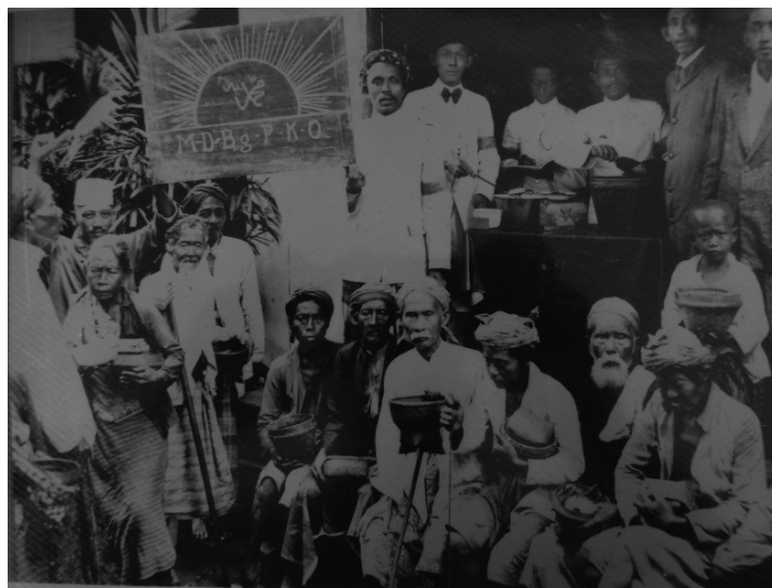
Zakat Distribution Activity by Hoofdbestuur Muhammadiyah of PKO Section to the Poor