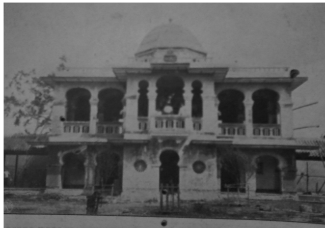
Mosque Complex of Muhammadiyah's Orphanage, Toengkak-Yogyakarta, 1930an

Besides take in waqf land and building, Muhammadiyah also obtained gebruik rights of Sultan and Pakualam to build Desaschool in Pakualaman, Bintaran Lor, Ngupasan, Notoprajan, Suronatan and Loro Ongko School in Bausasran, Kauman, Karangkajen. Although just get land use rights but Muhammadiyah can use it with unlimited time as long as it is still used for the benefit of public services. Muhammadiyah tried to accumulate that waqf for internal purposes and also for public services.