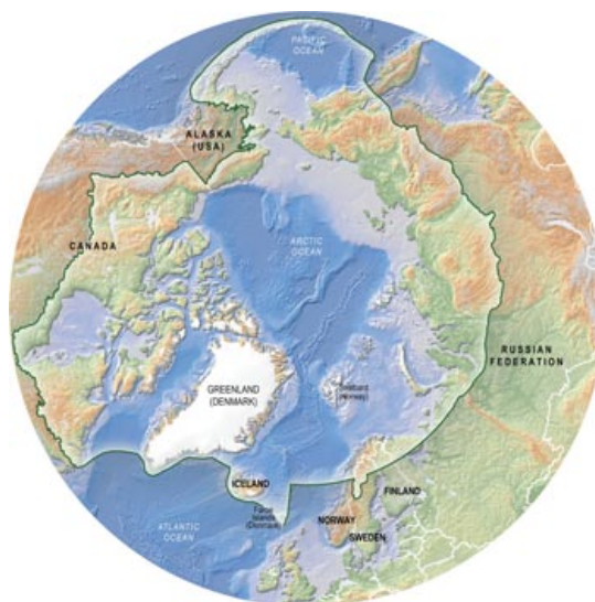
— CAFF Designated Area

For more information please contact: CAFF International Secretariat Borgir, Nordurslod 600 Akureyri, Iceland Phone: +354 462-3350 Fax: +354 462-3390 Email: caff@caff.is Internet: http://www.caff.is