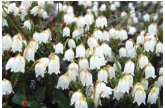
Cassiope tetragona (Arctic heather) Svalbard; photo courtesy of Ingibjörg Jónsdóttir

(Appendix I), which still serves as the ITEX foundation. The Founding Resolution was revisited during the 10th ITEX workshop in Abisko, Sweden, in September 2000 where an accord was made to supplement and extend the original Resolution (Appendix II). The network is coordinated through a steering committee, series of workshops and a website ( http://www.itex-science.net/ ).