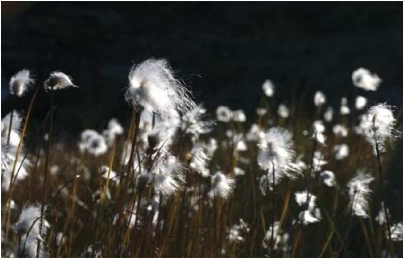
Cotton grass ( Eriophorum sp.); photo courtesy of Carsten Egevang ARC-PIC.COM