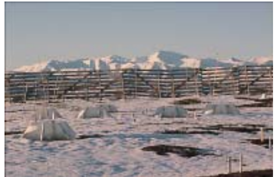
The ITEX site at Toolik Lake in Alaska where it is combined with a snow manipulation experiment; photo courtesy of Philip A. Wookey

species showed that key phenological events such as leaf bud burst and flowering consistently occurred earlier in warmed plots than controls; while growth cessation late in season was not affected (Arft et al. 1999). This suggests an increased probability of successful seed set in a warmer climate. Furthermore, the results showed a shift from initial growth stimulation in response to warming towards increased reproductive effort in later years. This shift from an initial to secondary response may reflect a period of depletion of