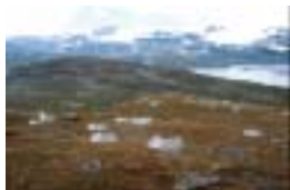
ITEX research area, Finse Norway

Beside these three syntheses, ITEX researchers have maintained high publication output from the individual sites they are responsible for (for overview, consult the ITEX bibliography: http://www.itex-science.net/library/biblio1.cfm ). Many of these publications address more complicated aspects of ecosystem responses to climate change, such as gas exchange, soil nutrient mineralisation, plant-microbial interactions, i.e. questions that need more sophisticated instrumentation and approaches than the basic ITEX questions.