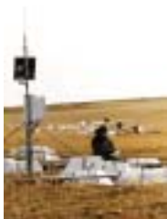
ITEX research area, Barrow, Alaska; photo courtesy of ITEX

spite of variable community response among sites, the meta-analysis detected an overall positive effect of warming on canopy height and dwarf-shrub cover, and a negative effect on cryptogam cover and community diversity.