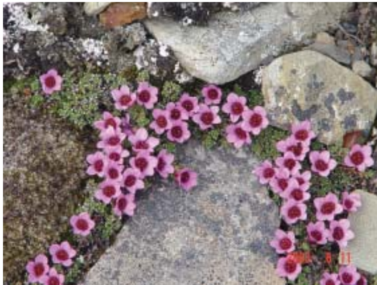
Saxifraga oppositifolia (purple saxifage), Svalbard; photo courtesy of Ingibjörg Jónsdóttir

Murray, D.F. 1997. Systematics of the ITEX species. Global Change Biology 3 (Supplement 1): 10-19.