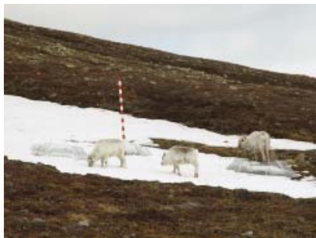
May 2005 Endalen: A newly established ITEX site in Svalbard where the effects of open top chambers are explored in habitats of variable winter conditions