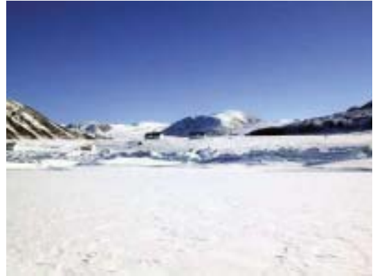
ITEX research area, Alexandra Fjord, Ellesmere Island, Canada; photo courtesy of ITEX

shrub cover and the melting of permafrost along the tundra-taiga interface in Alaska shows that these areas are already responding to climate change. The interface between the Low and High Arctic is another area that needs attention since it is delimited by the distribution of a large number of species.