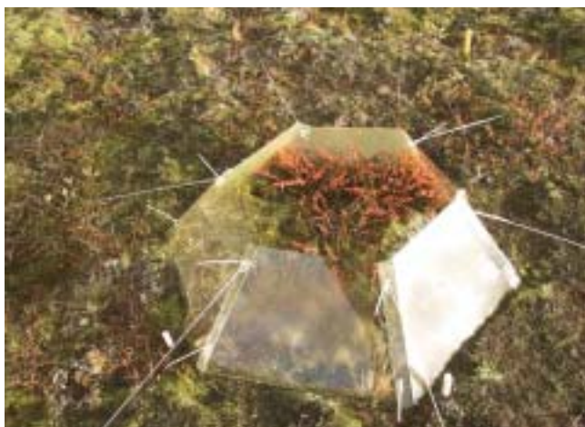
ITEX research area, Auðkúluheiði, Iceland; photo courtesy of Borgþór Magnússon

The main scientific achievements during the first decade of ITEX were summarised in the two first syntheses mentioned above. In general, a meta-analysis based on 13 different ITEX sites and 61