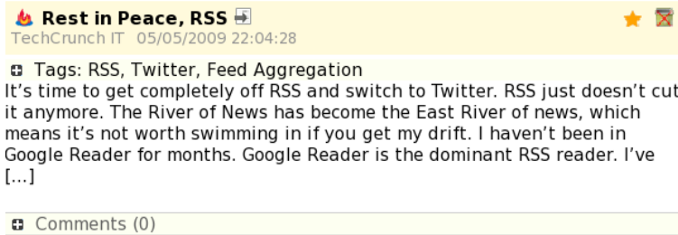
Figure 4: Detailed posting view

Keywords are one way to navigate through the bulk of articles. However, they rely on words already present in these articles, which might not be helpful in several cases – either because some relations are not expressible by the already available words or simply because an article's short version is too short to hold every significant reference. One way out of this inconvenience is to link articles manually to “keywords” – an approach called tagging [Ma06]. As can be seen in Figure 4 above, it is possible to associate several tags with an article. Since tags are likely and meant to repeat themselves throughout several articles, it is not only possible but also useful to build an overview map of all (or at least the most used) tags. These so-called tag clouds are essentially text-based diagrams (see Figure 5) that visualise the presence and the frequency of the most used tags [Ku07]. The more often a tag is referenced, the larger its font will be and it will therefore be emphasised in relation to other tags. Since these visualisations are usually made inside a fixed (rectangular) shape with varying intensity, they are called “clouds”.