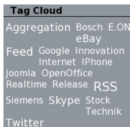
Figure 5: Detailed view of a tag cloud

Keywords are one way to navigate through the bulk of articles. However, they rely on words already present in these articles, which might not be helpful in several cases – either because some relations are not expressible by the already available words or simply because an article's short version is too short to hold every significant reference. One way out of this inconvenience is to link articles manually to “keywords” – an approach called tagging [Ma06]. As can be seen in Figure 4 above, it is possible to associate several tags with an article. Since tags are likely and meant to repeat themselves throughout several articles, it is not only possible but also useful to build an overview map of all (or at least the most used) tags. These so-called tag clouds are essentially text-based diagrams (see Figure 5) that visualise the presence and the frequency of the most used tags [Ku07]. The more often a tag is referenced, the larger its font will be and it will therefore be emphasised in relation to other tags. Since these visualisations are usually made inside a fixed (rectangular) shape with varying intensity, they are called “clouds”.