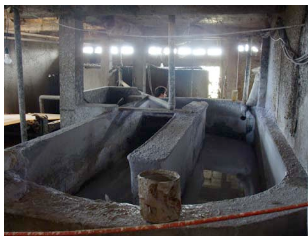
Figure 2. Paper treatment process to obtain final recycled paper

The last presentation was given by Dr. Henrik F. Larsen who exposed a case study on the production of printed paper from the point of view of Life Cycle Assessment (LCA) (Larsen et al., 2009). Interestingly, the speaker differentiated the impacts caused by the paper production itself from the printing operation, stressing and quantifying the contribution of emissions and ink components in the later one.