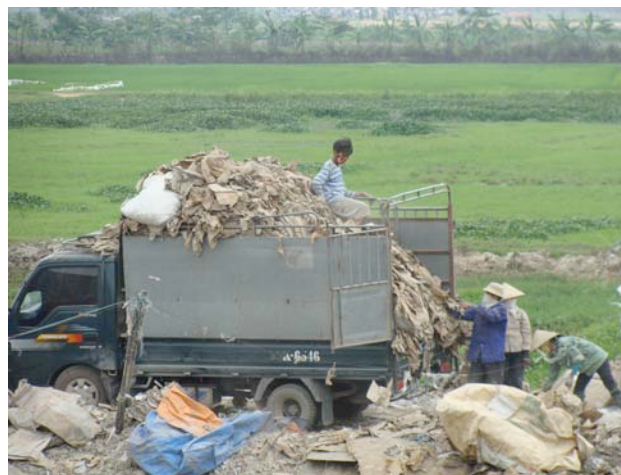
Figure 1. Recollection of paper in Vietnam to be recycled in villages

Prof. Dr. Damià Barceló's presentation focused on nonylphenol as an example of global pollutant extensively used in the textile, paper and leather sectors in form of polyethoxylated derivatives as non-ionic detergents. The profile presented covered its most relevant features on many aspects such as production, uses, mass flows, emissions to the environment, environmental occurrence, fate and degradation, health concerns, regulatory aspects and abatement measures.