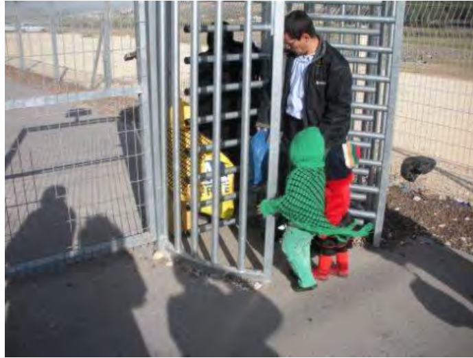
Figure 10: Turnstile in Huwwara, January 2009.

Additionally, Barag points out that on top of the turnstiles there are two lights, green (go) and red (no go). Simultaneously, she instructs me, the turnstile's operation is controlled by an Israeli guard, who is invisible to the Palestinian passenger. Once the passenger is inside the turnstile he is locked in until the invisible operator lets him out. The physical design that supposedly enables Palestinian discretion, however limited, is thus unnecessary and even misleading. The turnstile actually leaves no such discretion to its Palestinian user but rather is entirely controlled by the panoptic gaze of the Israeli soldier (but see Braverman 2008).