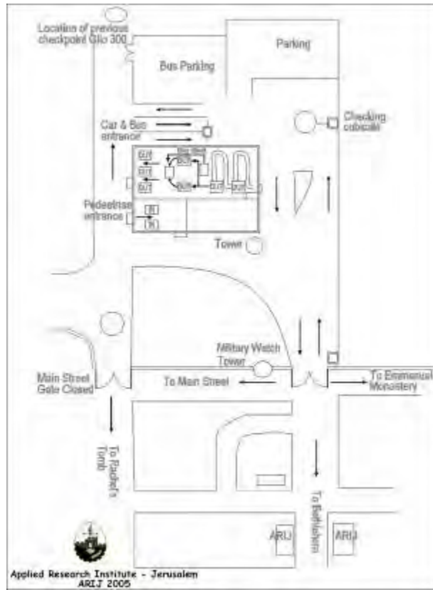
Figure 5: A 2005 scheme of Qalandia crossing (Israel on left, West Bank on right).

The new system includes a labyrinth of iron fences that channels passengers via a series of turnstiles. All passengers must go through five stages: the first set of turnstiles, the x-ray gates, the second set of turnstiles, the inspection booth and an x-ray machine for the bags. This entire process is captured by a dense network of cameras, and the passenger is given instructions via loudspeakers. From their protected booths, Israeli security personnel operate the revolving gates remotely, regulating the rate of passenger flow. The inspection booths are encased in bulletproof glass (Weizman 2007: 150).