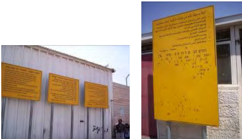
Figure 8: Signs on the Palestinian side of Qalandia crossing. Photos by author, August 2008

Now that written transcripts have come to exist, they are also vandalized as such, most likely by Palestinians. “Welco__ t_ th_ insp_ _ _ _ poi_ _” reads one of the signs, missing most of its Hebrew and English characters, probably a combination of Palestinian vandalism and Israeli neglect, not unlike the trash piling up at the entrance. The erased sign makes the site of instruction into a hollow caricature of itself, thus implicitly turning Israel’s visible regulatory efforts on their head. In effect, the signs, along with their erased letters, are both a proclamation of Israel’s new management of the crossings according to standardized norms, and a combination of two other statements: first, that inscribed by the Palestinians through their erasure of the letters of this text and, second, that of Israel’s underlying statement of neglect by not taking action to amend the vandalized situation.