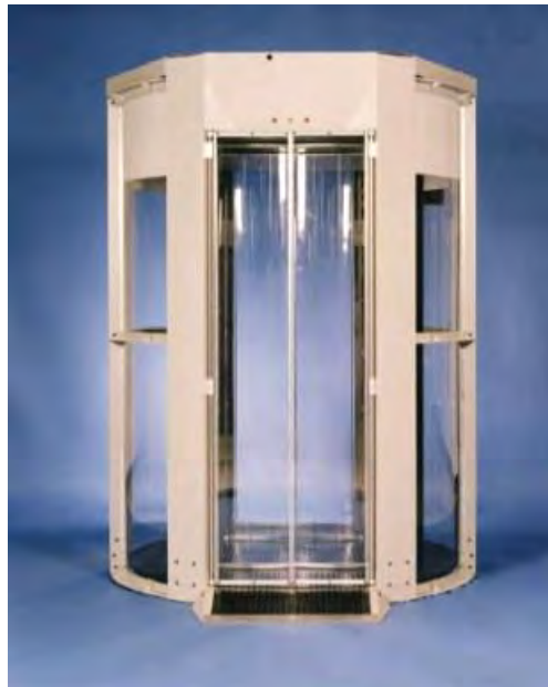
Figure 11: SafeView’s Safescout 360 model

The preference for automation in this case stems mainly from the risk to the lives of soldiers and the examiners and not just for the sake of efficiency itself. Because you know, there’s places where the speediest examination is always by a person, [while] the technological process takes more time. That’s why here they prioritized [security] (interview).