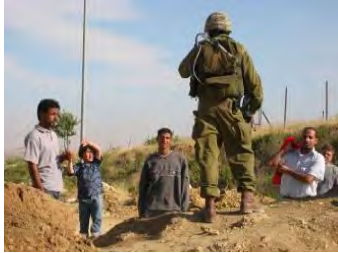
Figure 4: Old-style checkpoint in El Hader, south of Jerusalem. July 2004

The Separation Barrier contains 140 crossings composed of 40 or so pedestrian and commercial crossings and 100 agricultural gates (Tirza, interview). Not all crossings are staffed, Paz says, “because some are staffed only when they need opening.” He suggests that there are another 30 or so checkpoints within the West Bank (not along the border) and approximately 500 roadblocks (Paz, interview).