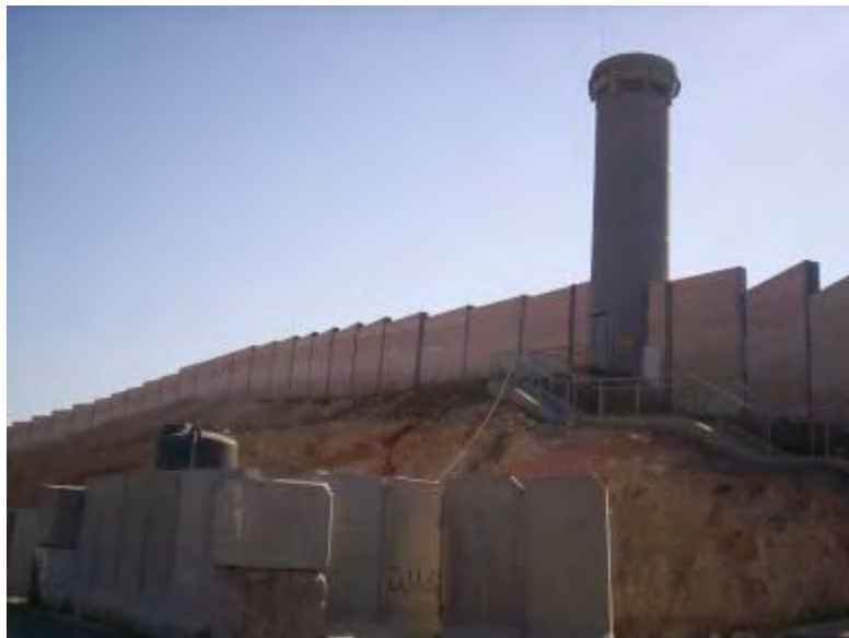
Figure 2: The Wall at Gush Etzion (Etzion bloc). Photo by author, August 2008

barrier is comprised of an electronic fence with dirt paths, barbed-wire fences, and trenches on both sides, at an average width of 60 meters (Figure 1). In some areas, a wall eight meters high has been erected in place of the barrier system. The Separation Barrier was to replace the previous situation whereby hundreds of checkpoints, mostly transient (or in the Israeli military jargon: “flying”; Handel 2007), were scattered through numerous routes, not only those leading into Israel but also those within the occupied territories themselves (Tirza, interview). The new border regime’s focus has been situated, conversely, on the line drawn between Israel and the occupied West Bank, and here is where its main efforts lie. In effect, the total number of checkpoints and roadblocks has been reduced in the new regime, a fact that the military officials interviewed here have highlighted to demonstrate Israel’s improved humanitarian attitude toward Palestinians (Paz and Tirza, interviews).