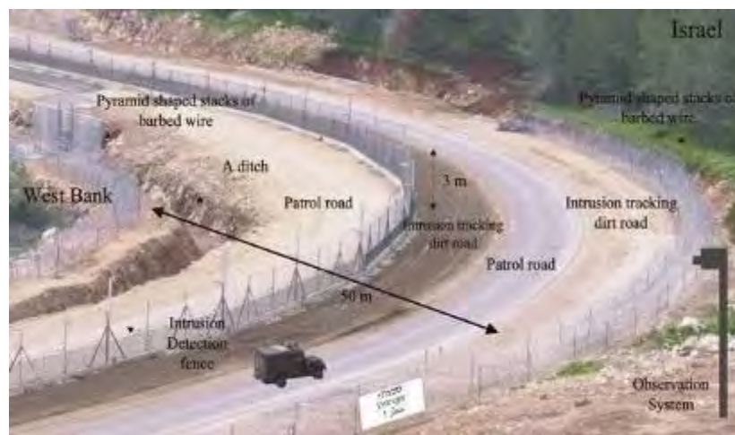
Figure 1: Israel’s Multilayered Security Fence System, 2008.

In June 2002, the government of Israel decided to erect a physical barrier to separate Israel from the West Bank. In most areas along its 723 kilometer-long route, the