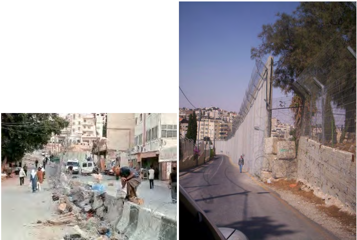
Figure 3: The same street in Abu-Dis before (on left) and after (on right) the Wall. Photo on left by Neta Efroni, February 15, 2002; photo on right by Rachel Naparstek, May 4, 2005. Both courtesy of MachsomWatch

Several years prior to the Wall's construction in Jerusalem, low concrete blockades and roadblocks were prominent in certain areas. This ad hoc border was "passable," in the sense that Palestinians soon found routes around, under, and over it (Figure 3, left). However, when visiting the village of Abu-Dis in north-east Jerusalem in the summer of 2008, I encountered a different scene altogether. The semi-structured border has turned into a 24-foot-high Wall (Figure 3, right), and thus the numerous improvised crossings have vanished from the border's landscape and replaced with large crossings situated at much further distances from one another. In effect, the people of Abu-Dis, some of whom are residents of Jerusalem, must now travel for miles—and through a border crossing – to reach what was once the other side of the street.