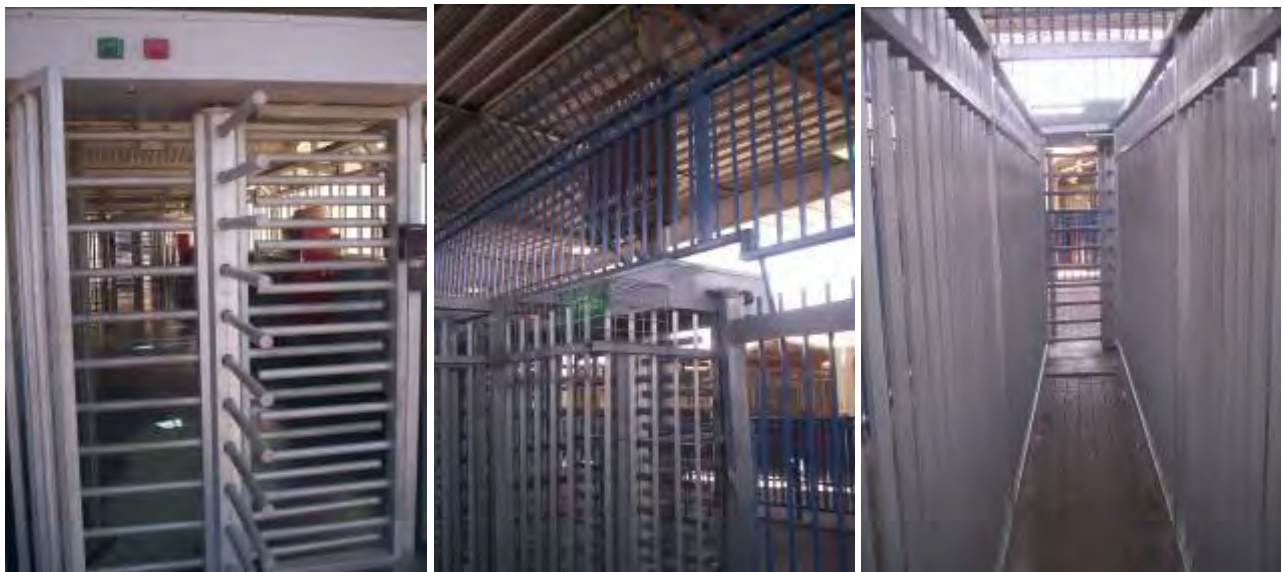
Figure 9: Queues and turnstiles in Qalandia. Photos by author, August 2008

After encountering the series of welcoming signs, the first stage in the actual movement through the crossing is the queue. Whereas officially, the queue is not part of the crossing itself but a preliminary function thereof, it is a critical stage in the Palestinian's experience of the border. Many Palestinians secure their position in line hours before the border crossing is officially open, hoping to make it to the other side on time to meet their employer just before the break of dawn. For years, the queues and their management were left to Palestinian responsibility and formed themselves in open space. Now, queues are constructed and enforced through metal fences that funnel Palestinian movement.