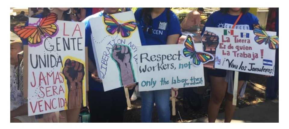
FIGURE 3. Marchers displaying their signs.

Fourth, a series of signs also turned criminalization rhetoric on its head, suggesting that United States