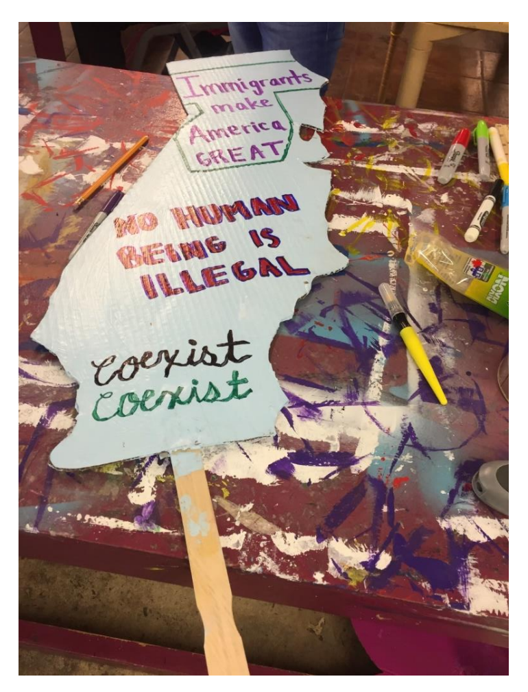
FIGURE 1. Sign created at the youth center in preparation for 2017 May Day march.

Second, slogans and signs at the May Day March also promoted unity by countering distinctions between "deserving" and "undeserving" immigrants<sup>61</sup>—and indeed, the very idea that national borders were a legitimate basis for distributing rights and benefits. The California state sign also included the words "Co-exist," repeated in two different