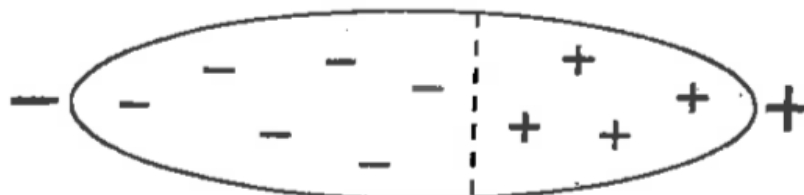
FIGURE 1. Force Field A (Teleological Balancing)

Notice how the competing interests operate only up to the line with no overlap.