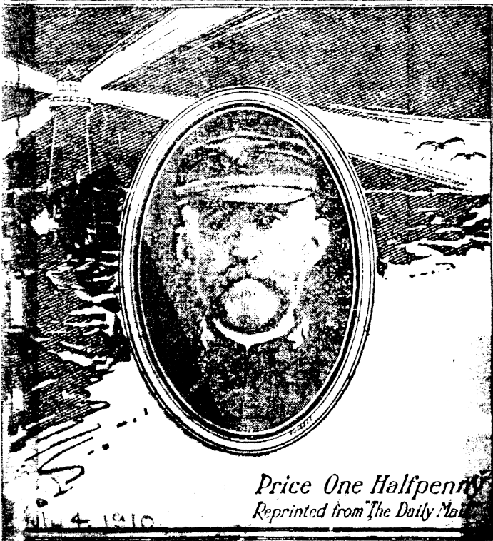
G9. Title page of pamphlet reprinting an article from The Daily Mail , (London, 1910) from the collection of the Eccles Library, Naval War College.