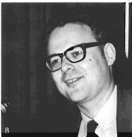
5. Honorable Elliot L. Richardson Under Secretary of State