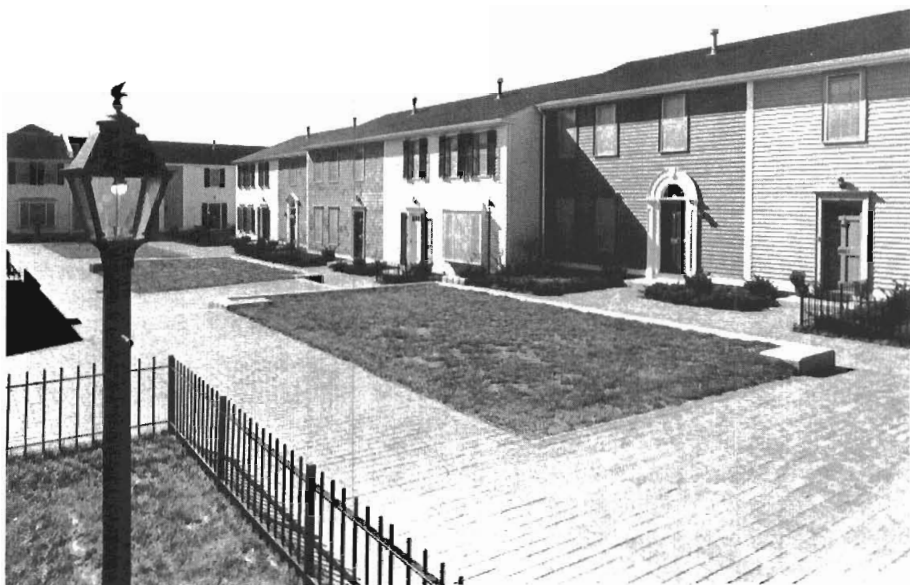
"Naval War College family housing," located on Fort Adams.

States, hosting such prestigious events as the America's Cup series and the Newport to Bermuda race, also offers the Navy Yacht Club. Within easy walking distance of the college, interested students and their families can rent either 30-foot Shields, 19-foot Rhodes, or 14-foot Mercury sailboats. The fine racing Shields craft, donated to the college by master sailor Cornelius Shields, offer a particularly exhilarating sense of speed and grace. The use of all boats is, of course, predicated on a thorough knowledge of sailing, and for those interested but unskilled, lessons are given. The more experienced sailors might want to enter the weekly intra-club races held during the summer months. Also available through the club are slips for boatowners and launching facilities for smaller craft.