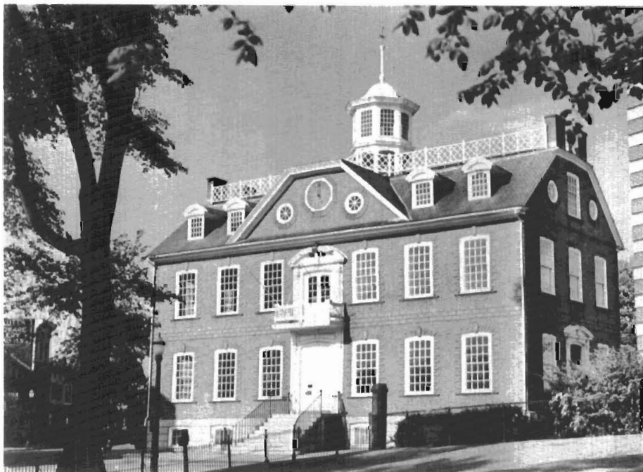
"The Colony House," one of the rare early government buildings of America (1739)

Historic Newport, one of the key cities in the upcoming bicentennial celebration, also boasts over 300 pre-Revolutionary War buildings, more than any city in the United States. The old homes and public buildings, combined with the narrow streets (designed for horse traffic and often a challenge for horseless carriages) create an 18th century seaport atmosphere. Where else, for example, could a visitor dine in an 18th century tavern on fine local cuisine, step outside and see a waterfront filled with square-riggers and the finest sailing ships on the east coast? Numerous buildings have been restored to their colonial state by private owners or local organi-