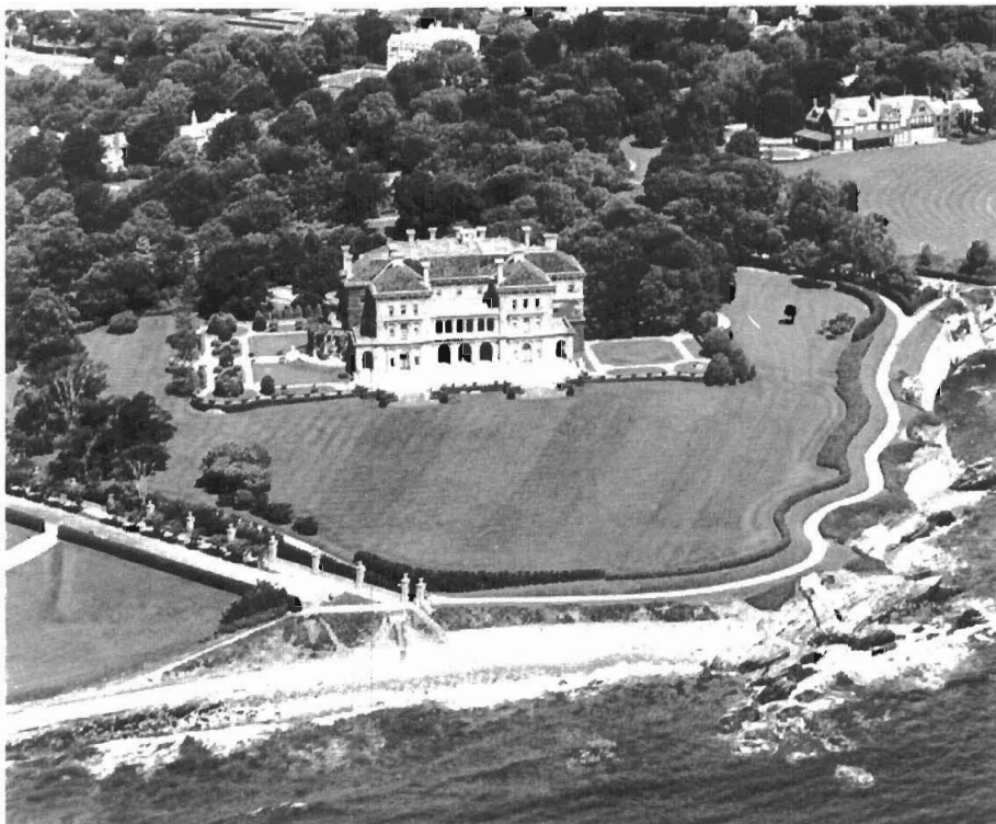
"The Breakers," built for Cornelius Vanderbilt in 1895.

zations and are open to the public, and many of them have particular historic significance. The Touro Synagogue, for example, was the first synagogue constructed in the new land. As a measure of how risky an undertaking this was, the synagogue was built with a secret escape tunnel! Trinity Church and the Old Colony House also stand as splendid examples of colonial architecture. The Newport Artillery Company boasts a unique history and the honor of being the oldest (1741) continuous commissioned military unit in the United States. A decided advantage to the sightseer is that all of these 18th century buildings are within walking distance of one another in downtown Newport.