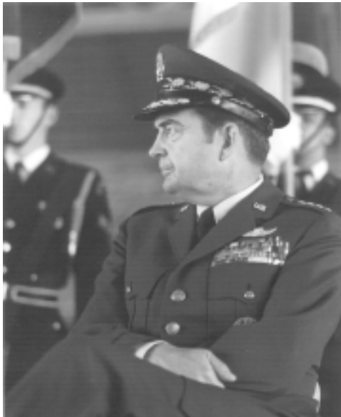
General David C. Jones, chairman of the Joint Chiefs of Staff

Third, military officers serving in joint-duty assignments were insufficiently qualified, by either education or experience. As Congress found, officers did not want to serve in joint assignments; they knew that in such billets they would be monitored for loyalty by their parent services. In the Navy in the mid-1980s, joint duty was considered the “kiss of death”; it meant that one’s career was over.