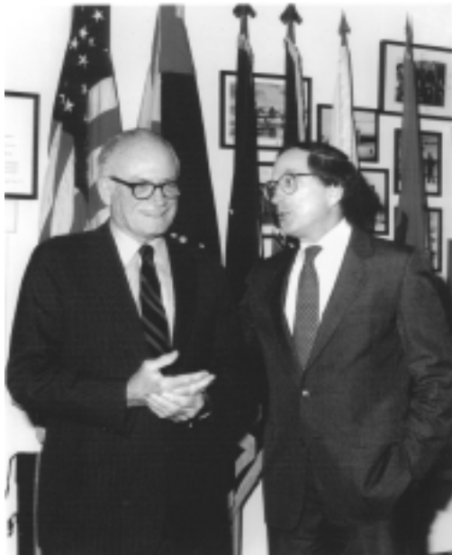
Senators Barry Goldwater and Sam Nunn, chairman and ranking minority member of the Senate Armed Services Committee

In 1985, four events began to shift the balance in favor of reform. Senator Barry Goldwater (R-Arizona) became chairman of the Senate Armed Services Committee and made defense reorganization his top priority. He formed a partnership with the committee’s top Democrat,