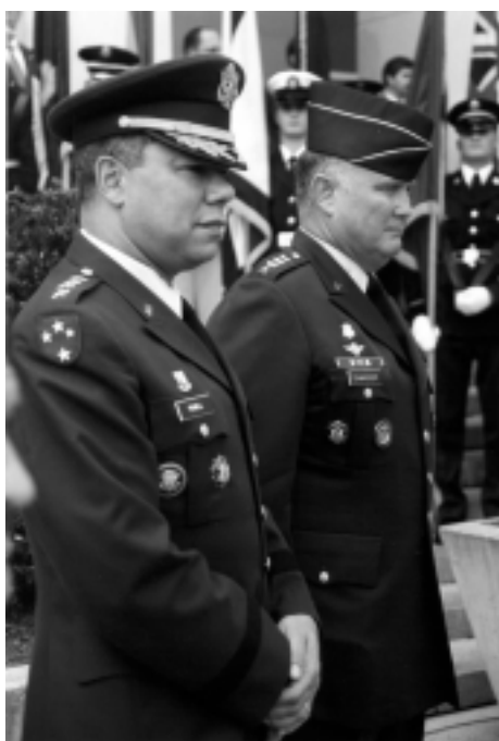
General Colin L. Powell, chairman of the Joint Chiefs of Staff, and General H. Norman Schwarzkopf, commander in chief, U.S. Central Command, at the Pentagon on 15 August 1990

Of course, the most conspicuous success for Goldwater-Nichols has been in the realm of military effectiveness; there have been overwhelming operational successes since the law was passed. General Colin Powell observed, “Performance of the Armed Forces in joint operations has improved significantly and