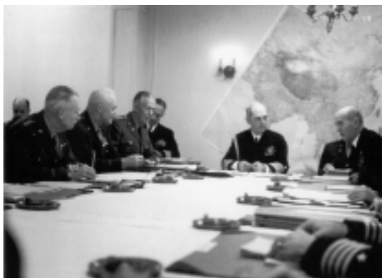
Admiral William D. Leahy (seated at head of table) presides at a meeting of the Joint Chiefs of Staff in 1944. Generals George C. Marshall and Henry H. Arnold are to Leahy's right, and Admiral Ernest J. King is to his left.

However, the contributions of the JCS were lessened by its adoption on its own of the principle of reaching unanimous agreement before speaking ex cathedra . Accordingly, the wartime Joint Chiefs—General Hap Arnold, the commanding general of the Army Air Forces; General George Marshall, the chief of staff of the Army; Admiral William Leahy, the chief of staff to the commander in chief (that is, President Roosevelt); and Admiral Ernest King, the Chief of Naval Operations—had essentially to operate by cooperation.