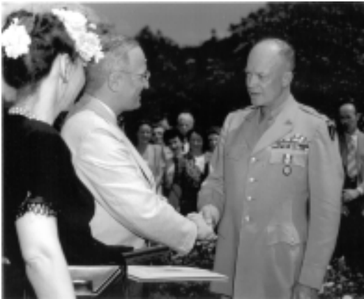
As Mrs. Eisenhower looks on, President Harry S. Truman shakes hands with General Dwight D. Eisenhower during an award ceremony in the White House Rose Garden on 18 June 1945.

Congress was also divided on the unification issue; each service's view had strong supporters. But Congress ended up opposing Truman's proposals, for two main reasons. One was its own constitutional competition with the executive branch. Members of Congress feared that the executive branch might be able to organize its military affairs so effectively that Congress would be at a dis-