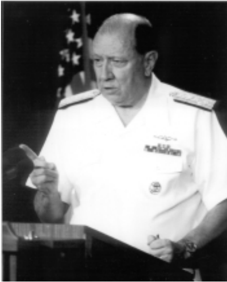
Admiral William J. Crowe, Jr., chairman of the Joint Chiefs of Staff

1994 to 1997, considers Goldwater-Nichols “perhaps the most important defense legislation since World War II.” 19