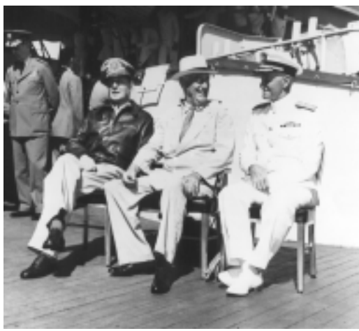
General Douglas MacArthur, President Franklin D. Roosevelt, and Admiral Chester W. Nimitz aboard the heavy cruiser USS Baltimore (CA 68), June 1944

The United States entered the Second World War with an archaic organization that was incapable of coordinating land, sea, and air activities across the two military departments, or even of harmonizing business (procurement, logistics, construction, transportation, etc.) efforts within the departments themselves. In February 1942, President Franklin D. Roosevelt created by executive direction the Joint Chiefs of Staff (or JCS), primarily to work with the British, who had a