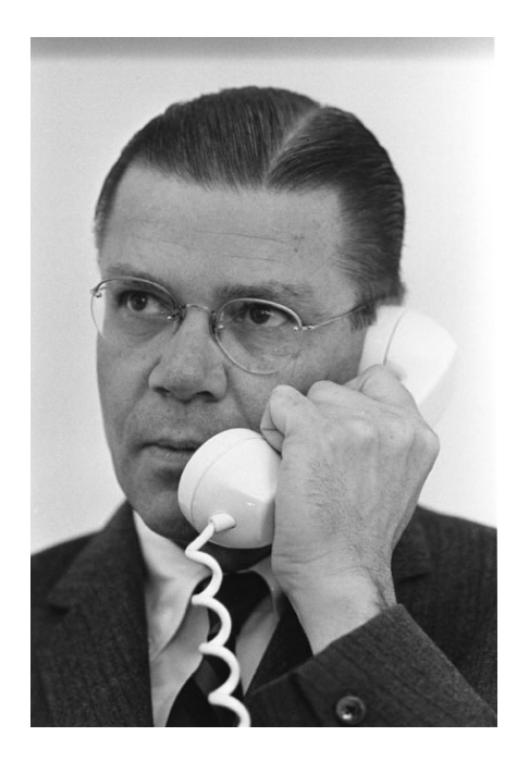
Robert S. McNamara

McNamara bring a modicum of coherence and integration to the overall administration of the Defense Department in the 1960s. The price, however, was a ruthless, relentless bureaucratic struggle that not only contributed to the disaster of Vietnam but left a legacy of suspicion and deceit that infects American civil-military relations to this day.<sup>50</sup> (Even today, embittered officers identify their nemesis by his full name—Robert Strange McNamara—to express their loath-