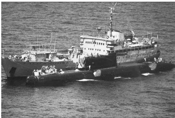
A Juliett-class submarine being repaired at sea

This experiment in naval aviation, however innovative, was never intended to offset U.S. air superiority. The Ka-25 helicopter, of which the Moskva and its sister ship Leningrad could accommodate a maximum of eighteen each, was slower and of shorter range and endurance than its U.S. counterparts, and an easy target for NATO fighters. One hypothesis is that the Moskva had been originally designed to extend the range of shore-based ASW helicopters engaged in anti-Polaris operations in the Barents Sea. In the Mediterranean, however, without proper support facilities, the ship proved ineffective, “far too small and vulnerable for operating . . . on the far side of the Straits.” 53 The many deficiencies in the Moskva's design—ranging from inadequate length and poor seakeeping characteristics in rough weather to an aircraft complement too small for its intended ASW purpose—accelerated the ship's replacement by the first full-size Soviet carrier, the Kiev (pr. 1143), which first operated in the Mediterranean in 1976. 54