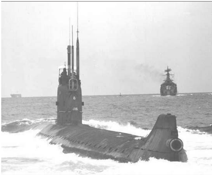
A November-class submarine during Soviet naval exercises

The U.S. carrier groups were met by four cruisers ( Moskva , Dzerzhinskii , Groznyi , the gun-armed light cruiser Mikhail Kutuzov [Sverdlov class/pr. 68-A]), three SAM destroyers ( Bravyi [converted Kotlin class], Bedovyi , Boikii [Krupnyi class/pr. 57bis]), three SAM destroyers ( Reshitel'nyi , Soobrazitel'nyi , and Krasnyi Kavkaz [all Kashin class]), four gun destroyers ( Nakhodchivyi , Blagorodnyi [both Kotlin class], Sereznyi , and Sovershennyi [both Skoryi class/pr. 30bis]), six escort vessels, six SSGs (conventionally powered cruise-missile submarines of