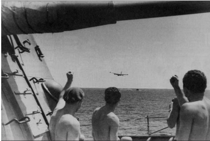
Soviet sailors shake their fists at a U.S. P2V Neptune flying over a submerging Soviet submarine in the Mediterranean.

Fleet on 1 October for a new base in Havana. 7 They faced the unenviable task of penetrating a U.S. blockade conducted by (on average) forty ships, 240 aircraft, and thirty thousand personnel. 8 In addition to this overwhelming force, the Soviet submariners were tackling immense technical and mechanical difficulties. Since Soviet nuclear submarines were at that time relatively unsafe and untested,