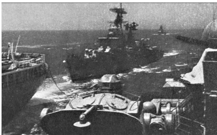
View from the cruiser Zhdanov , being refuelled in the Mediterranean, 1973

In an alarming development, on the day of Brezhnev's note to Nixon, a Soviet surface group was sent to Port Said. 167 It consisted of the Admiral Ushakov , the SAM destroyer Otvazhnyi , the SAM destroyers Neulovimyi (Kildin) and