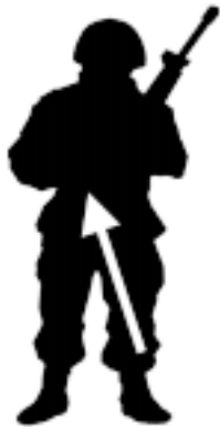
FIGURE 3 A STATIONARY SOLDIER'S CoG

physicist could treat both masses as one and calculate a common center of gravity of the total mass; however, if the struggle proceeds at a rapid pace, the CoG will change constantly.