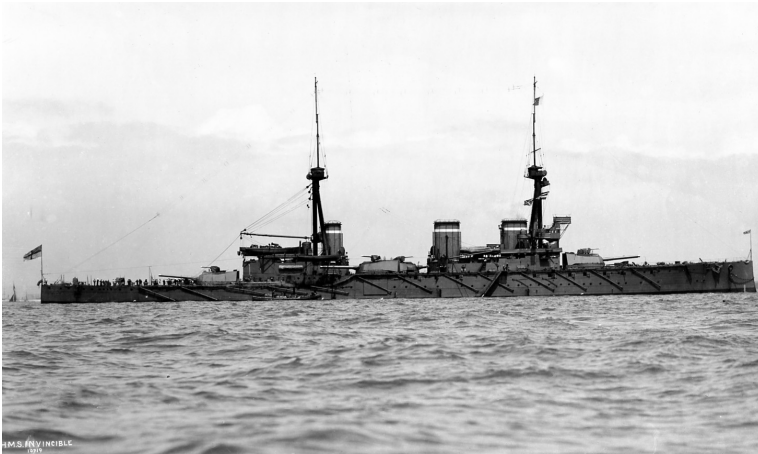
HMS Invincible , 1909