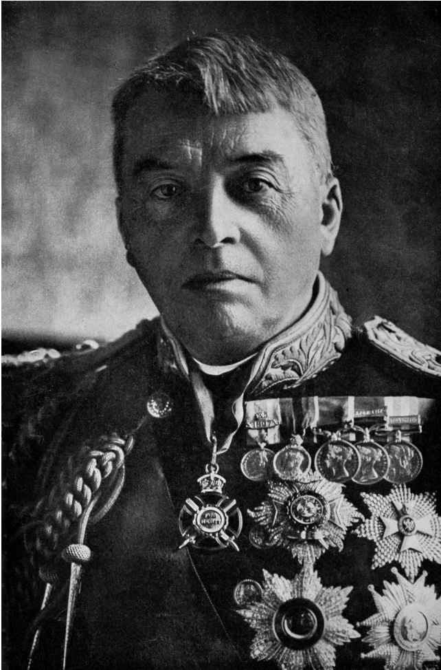
Admiral Sir John "Jackie" Fisher

adopting a radically different vision of future naval warfare—a vision he believed that advances in technology were on the verge of delivering. Specifically, Fisher worried about the continuing soundness of each of the three main naval missions mentioned above. The “anti-invasion” battle fleet looked to be increasingly threatened in coastal waters by the torpedo, while the station cruiser and commerce protector abroad were similarly under threat from the sheer speed and reactivity of the modern armored cruiser squadrons then under development by France and Russia. Worse still, however, was the manpower situation. In essence, and because of the growth in the numbers of these older cruisers scattered around the world, a large percentage of the navy’s available manpower was committed abroad on stations where it could learn little about the techniques and drills associated with modern warfare, or anything of fleet maneuvers. To Fisher this was an unforgivable waste in an era where naval warfare was increas-