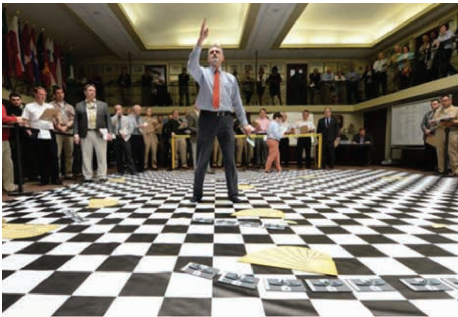
Naval War College faculty and students revisiting the battle of Jutland on the historic war-gaming floors of Pringle Hall, May 2016.

Over the two hundred years since Trafalgar and the one hundred since the battle of Jutland, the strategic perspectives gained from studying this rich history remain relevant to contemporary strategic thinkers as the U.S. Navy charts a fresh course through the twenty-first century and beyond.