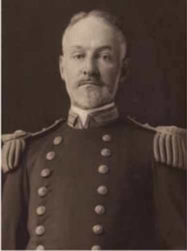
Captain William S. Sims, USN. Circa 1910.