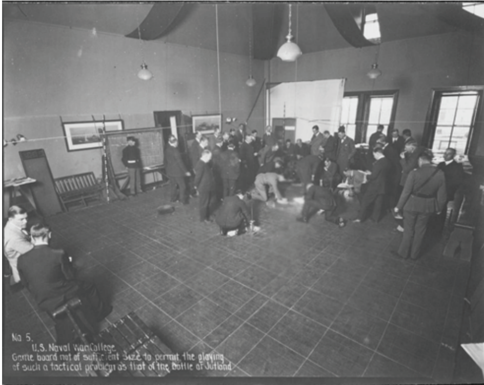
Examining the battle of Jutland on the third floor of Luce Hall, Naval War College. Circa 1916.