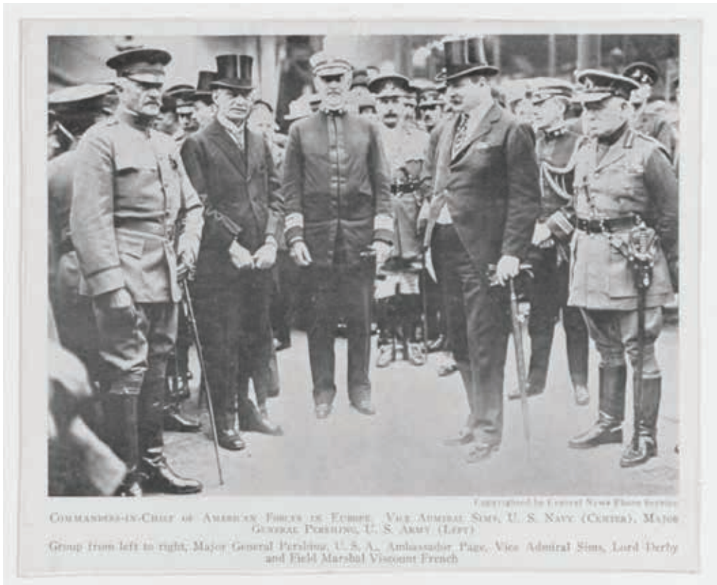
Rear Admiral Sims, standing at center, pioneered new concepts of U.S. naval organization in wartime as Commander, U.S. Naval Forces in Europe and as senior naval representative of the American Expeditionary Force on the Supreme Allied Naval Council between 1917 and 1919.