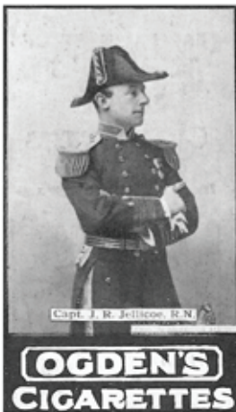
Admiral John Rushworth Jellicoe, RN, Grand Fleet commander at Jutland, as a captain. Circa 1905. His appearance on a cigarette package highlights the superstar status he held in the Royal Navy—before Jutland.

As skipper of an American battleship, Sims then symbolically sailed into the limelight of the international media: six years before the battle of Jutland, Jellicoe and Sims celebrated an undeclared Anglo-American alliance. The Royal Navy hosted the USN battleships of the Atlantic Fleet's 3rd Battle Squadron for Thanksgiving of 1910. As skipper of Minnesota , the flagship, Sims reveled in the spirit of Anglo-American collaboration. In early December, Sims and his crew attended a series of events at Guildhall in central London. Commenting on the traditional maritime connections