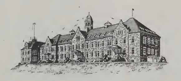
Naval War College Newport, Rhode Island 2006