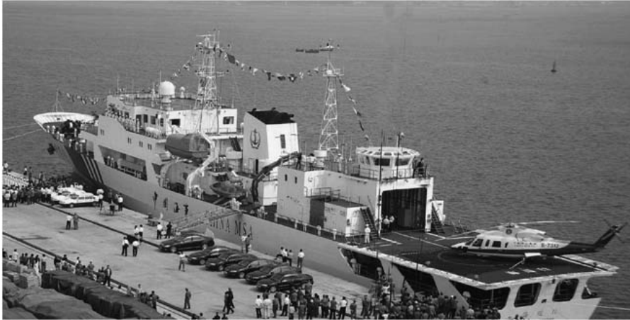
Photo 5. The large cutter Haixun 11 of the MSA was commissioned in September 2009 in Qingdao. In terms of resources and personnel, the MSA, which is part of the Transportation Ministry, appears to be the most influential among China's civil maritime agencies.

continuous months on board, then one month ashore. Crew members are thus at sea about eight months per year. 47