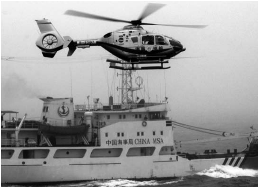
Photo 7. Search and rescue is a major mission of the MSA and aviation assets are now a development priority for MSA and Chinese civil maritime agencies more generally. However, deck aviation is still a relatively new concept for Chinese civil maritime authorities.

China's maritime rescue service has come a long way in a short time. In 1999, the MSA was faced with a Titanic -like tragedy when the ferry Dashun went down in bad weather just a few miles offshore in the Yellow Sea. Out of 304 passengers and crew, there were just twenty-two survivors. 55 The accident, a major national tragedy, helped to galvanize efforts to establish a much more vigorous maritime rescue service. As Captain Bernard