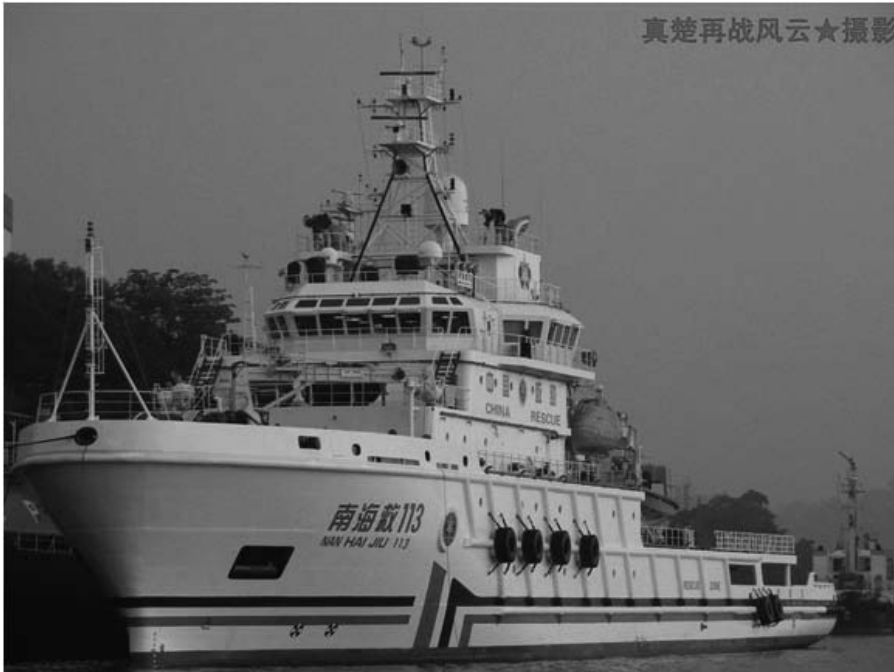
Photo 24. Nanhai Jiu 113 of the Rescue and Salvage Bureau of the MSA will serve off the coast of southern China and is one of several new vessels that the MSA has developed in the last decade.

At least three possible strategic implications can be drawn from the foregoing analysis. Most obviously, stronger Chinese coast guard entities will no doubt serve to strengthen China's extensive maritime claims. More and better ships and aircraft at Beijing's disposal will likely increase its confidence in maritime disputes with its neighbors. As stated clearly in the Ningbo Academy study, China will continue to "build up its military maritime power, developing the power to safeguard its national territorial and maritime rights and interests." 139 Yet there is also the practical consideration that "relying on the navy . . . makes it easier for certain other countries to use the excuse of 'the China threat theory.'" 140