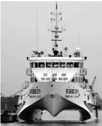
Photo 6. This catamaran, Donghai Jiu 201, serves with the Rescue and Salvage Bureau of the China Maritime Safety Administration. Catamarans are in wide use now as ferries and also with the PLA Navy.

commercial ferry designs. 48 The MSA has notably lacked small motor surfboats and may have recently purchased some from the United Kingdom. 49 However, attention to smaller cutters is evident in the 2008 launch at Wuhan of a new forty-meter design, optimized for Yangtze River rescue operations. 50