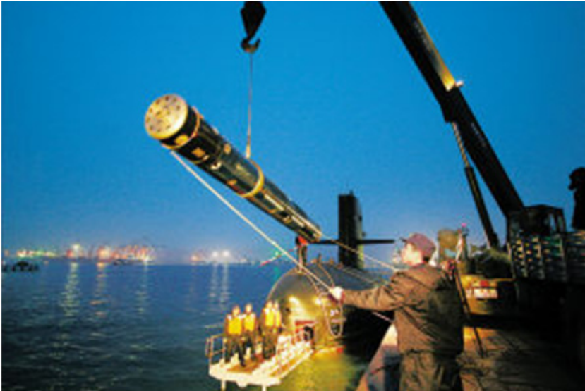
Photo 5. Submarine Mine. PMK-2 propelled mine being loaded onto Song-class diesel submarine at Qingdao.