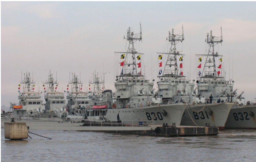
Photo 8. PLAN Minesweepers.

MIW is a major surface fleet mission. The PLAN has stressed speed, 277 automation and electronics, 278 and “all-weather” minelaying capabilities. 279 Jianghu-class frigates have conducted minelaying as part of ASW training. 280 Captains of minesweepers train at a special center at Lushun naval base. 281 Minesweeping units have recently practiced laying various types of moored and deep bottom mines as part of fast-paced, confrontational exercises. One South Sea Fleet minesweeping unit has recently participated in over ten such exercises, in which it “achieved 26 scientific research results” as part of a larger effort to keep abreast of a “new global revolution in military affairs” that includes “network-centric training” and “the intelligization of sea mines.” 282 Indeed, the PLAN apparently views minesweepers equipped with “torpedo” (mobile) mines as a viable ASW platform that illustrates the potential for “old equipment + networks + talent” to “thoroughly convince” those who believe that “it is not possible to establish a platform for informatized exercises on old equipment.” 283 In 2002, a North Sea Fleet unit including minesweepers 813 and 811 attacked submarines with “both foreign and domestic torpedo sea mines” with a “100% success rate.” 284 More recently, all three of China’s fleets have trained with what appear to be advanced mobile mines. In December 2005, North