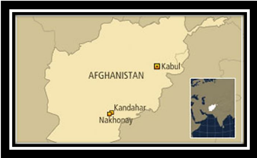
Figure 1: Nakhonay