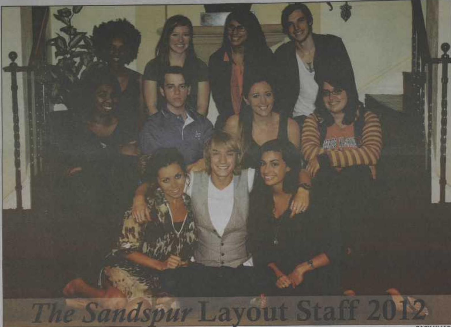
The Sandspur Layout Staff 2012

Want The Sandspur to feature your group's events on our calendar? Email them to submit@thesandspur.org