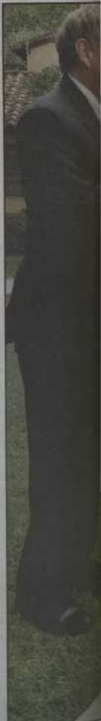
MESSANGER OF PEACE laying down her story