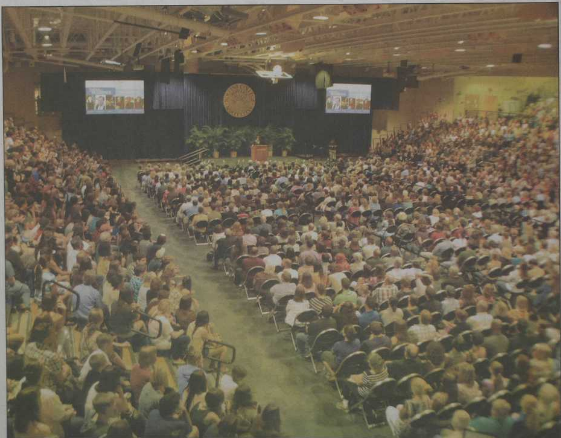
COME ONE, COME ALL: Thousands of people turned up to the Alford Sports Center to hear Goodall's words, including local central Florida citizens. Several audience members drove hundreds of miles while others flew in to attend the event.