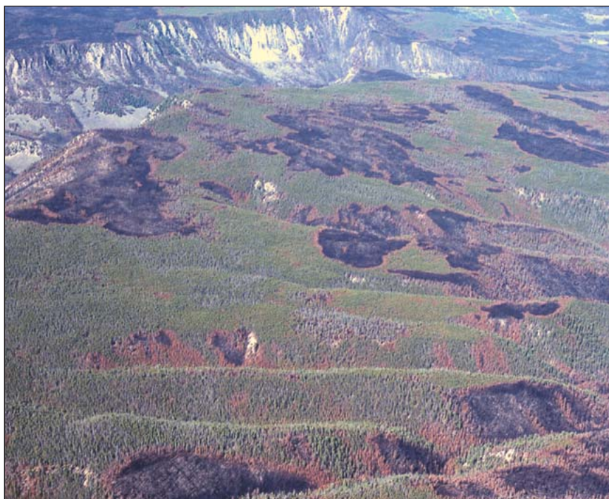
Figure 2. A mosaic fire pattern in Madison Canyon, Yellowstone National Park, approximately one year after the major 1988 fires.

The complexity created by variability in fire regimes defies a simple, one-size-fits-all prescription for restoration. Fortunately, plant association groups, which have predictable relationships to fire regimes (Table 1), provide a classification of this diversity that is useful for man-