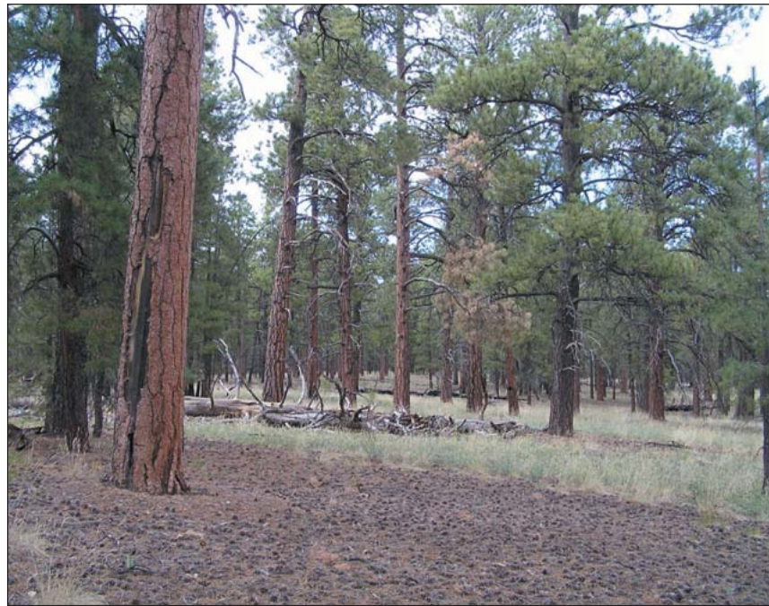
Figure 3. A restored ponderosa pine stand, Grand Canyon National Park (North Rim).

Our key findings on post-fire management are as follows. First, post-burn landscapes have substantial capacity for natural recovery. Re-establishment of forest following stand-replacement fire occurs at widely varying rates; this allows ecologically critical, early-successional habitat to persist for various periods of time. Second, post-fire (salvage) logging does not contribute to ecological recovery; rather, it negatively affects recovery processes, with the intensity of impacts depending upon the nature of the logging activity (Lindenmayer et al. 2004). Post-fire logging in naturally disturbed forest landscapes generally has no direct ecological benefits and many potential negative impacts (Beschta et al. 2004; Donato et al. 2006; Lindenmayer and Noss 2006). Trees that survive fire for even a short time are critical as seed sources and as habitat that sustains biodiversity both above- and belowground. Dead wood,