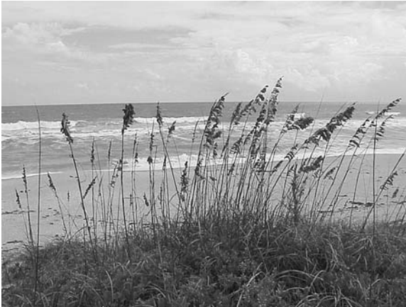
PLATE 1. Dune with sea oats ( Uniola paniculata ) overlooking the beach at the Archie Carr National Wildlife Refuge, Florida, USA.

hart and Raymond 1983; see also Archie Carr National Wildlife Refuge web site) 2 . The distribution of nests along the beach is not uniform, but resembles a gradient (Weishampel et al. 2003). Over the 15-year period from 1989 through 2003, the southern half of the study area had 2.3 times the number of loggerhead nests (649 nests·km -1 ) and 3.8 times the number of green turtle nests (34.7 nests·km -1 ) as the northern half. Though the annual number of nests for each species fluctuates and loggerhead nesting has been occurring earlier each season (Weishampel et al. 2004), the general spatial patterns of nest distribution have been very consistent inter- and intra-annually (Weishampel et al. 2003, 2006).