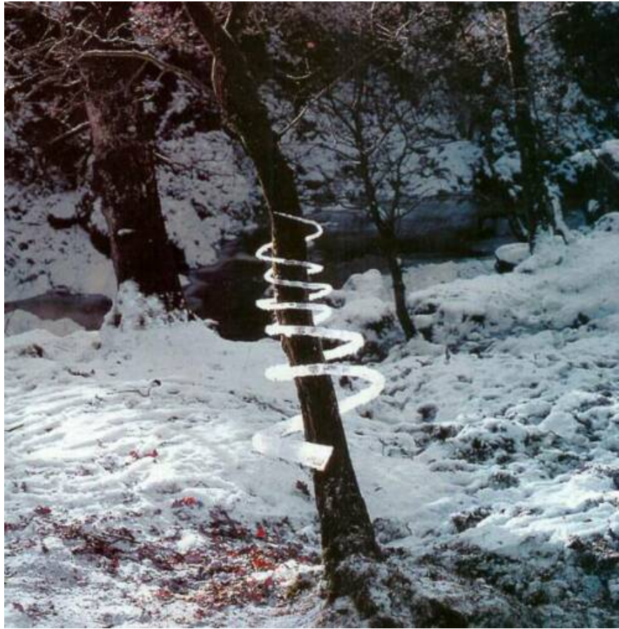
Figure 6 – Andy Goldsworthy, Tree Soul, 1997, from Galerie Lelong, NY

Goldsworthy explains, "...movement, change, light, growth and decay are the lifeblood of nature, the energies that I try to tap through my work. I need the shock of touch, the resistance of place, materials and weather, the earth as my source. Nature is in a state of change and that change is the key to understanding. I want my art to be sensitive and alert to changes in material, season and weather. Each work grows, stays, decays. Process and decay are implicit. Transience in my work reflects what I find in nature" (64). However, my work differs from Goldsworthy's, as I place my emphasis on creating parallels to human existence and the human condition, whereas Goldsworthy places the focus primarily on nature.