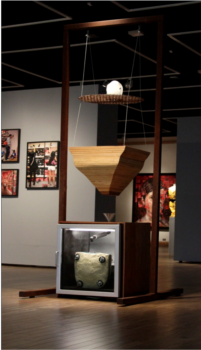
Figure 9 – Jeff Hoffman, Sentience , 2012