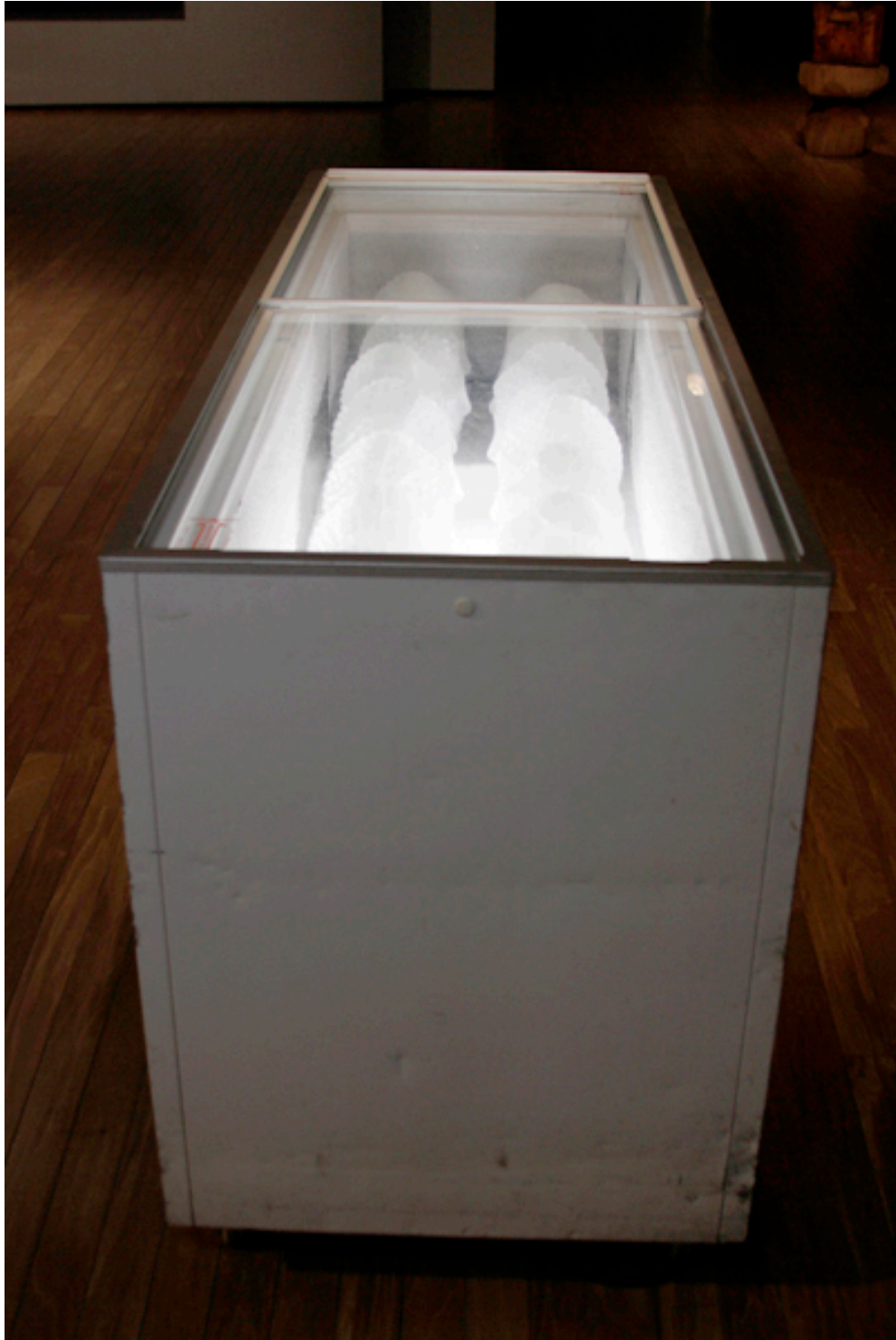
Figure 10 – Jeff Hoffman, Mass Storage , 2012