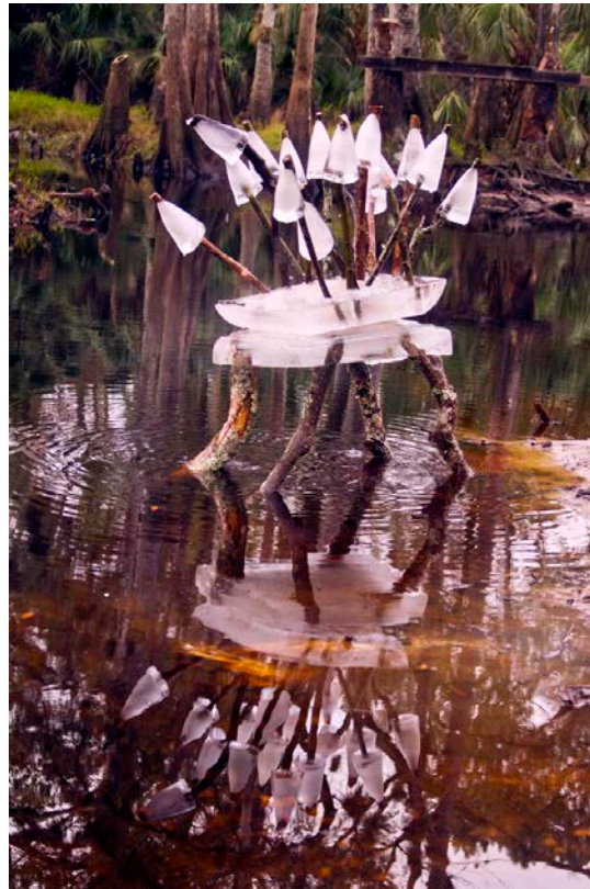
Figure 1 – Jeff Hoffman, Entropic Mind , 2012

the disintegration which occurs from the unseen forces of gravity, heat and time upon sculptures made from natural elements and ice (figure 1).