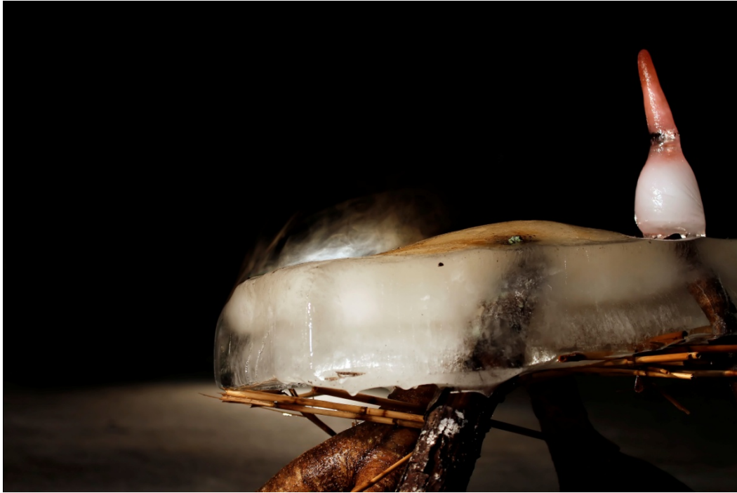
Figure 13 – Jeff Hoffman, A Cross Section of Time , 2012

move again. These subconscious clues help us transition into a more open, accepting state. The refracting and the reflected light pull our eyes along a z-axis from foreground to background. Eventually rhythms occur that we could almost tap our foot to.