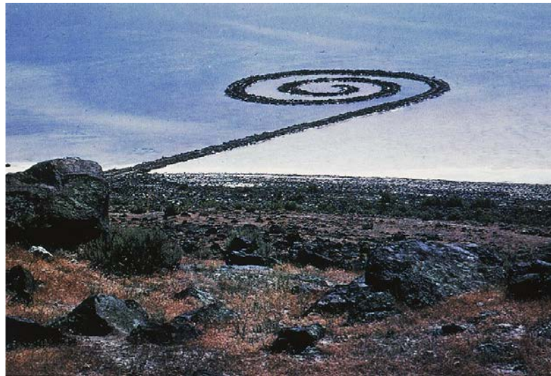
Figure 3 – Robert Smithson, Spiral Jetty , 1970,

in and connects all life, is the primary subject. In its various physical states, it is juxtaposed to elements such as wood found in its naturally occurring textures. I search for pieces of wood exhibiting interesting and varied surfaces that have been created solely from naturally occurring events including decay and the growth of lichen.