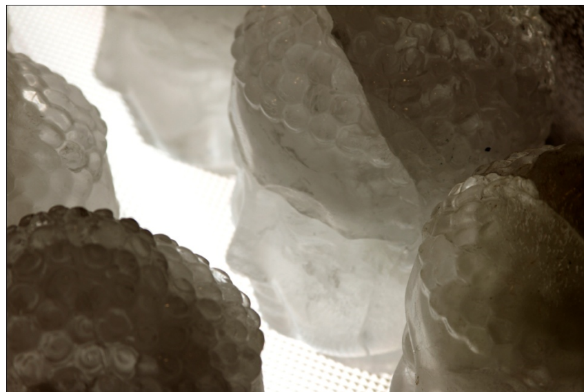
Figure 12 – Jeff Hoffman, Mass Storage , 2012

In the work Piñata , the vapor, which moves across the ice and shimmers with light, emulates how we breathe (figures 4 and 5). As it blows in one direction we inhale, and then as it pauses, we do the same and eventually exhale when it finally changes direction and starts to