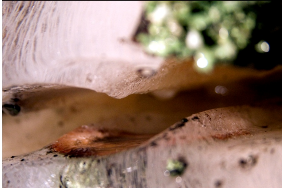
Figure 17 – Jeff Hoffman, Salient Nothing , 2012

fundamental truths of the physical world I aim to provide are what need to be considered. That is, in time, and under the effects of gravity, everything changes.