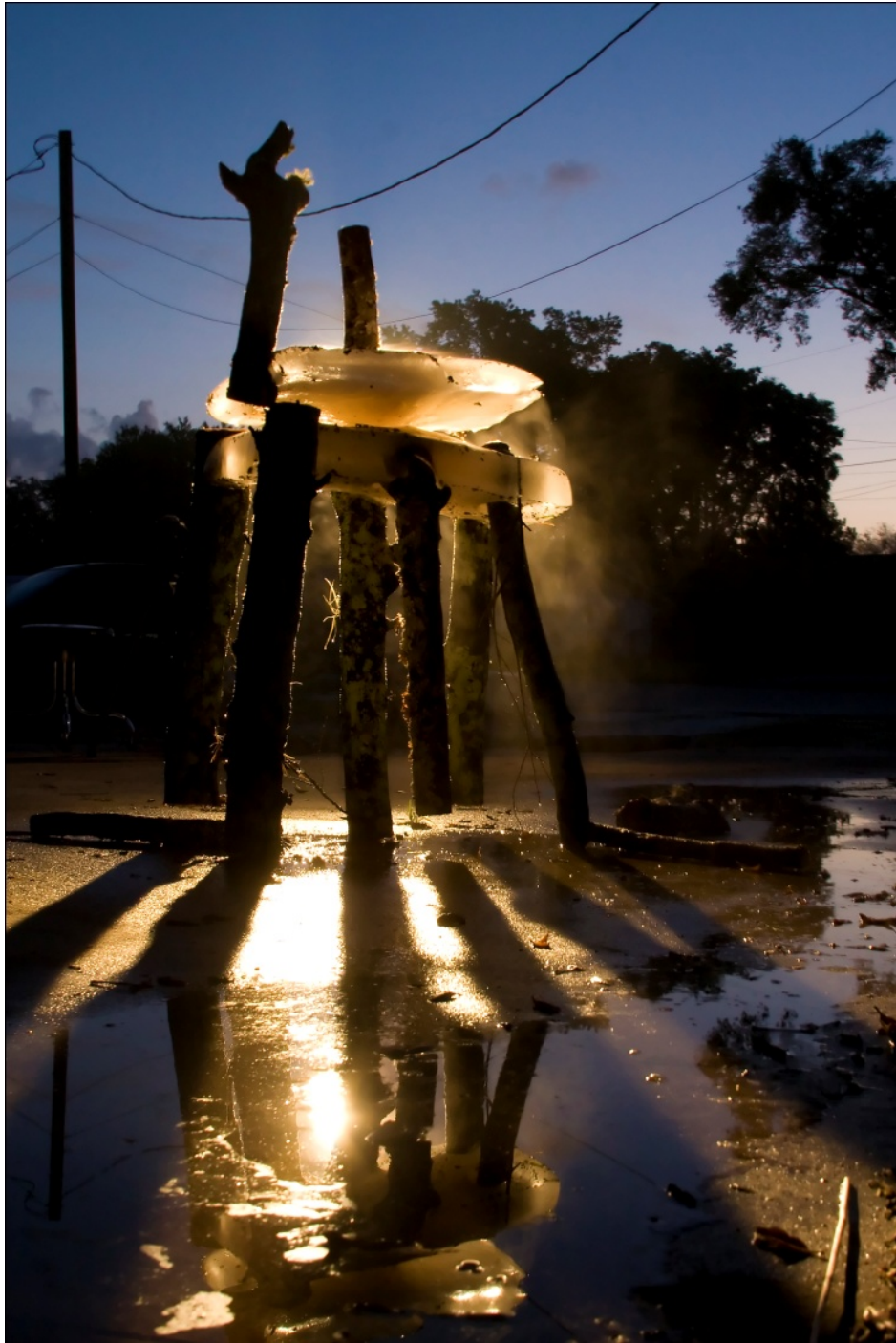
Figure 18 – Jeff Hoffman, Slow Burn , 2011