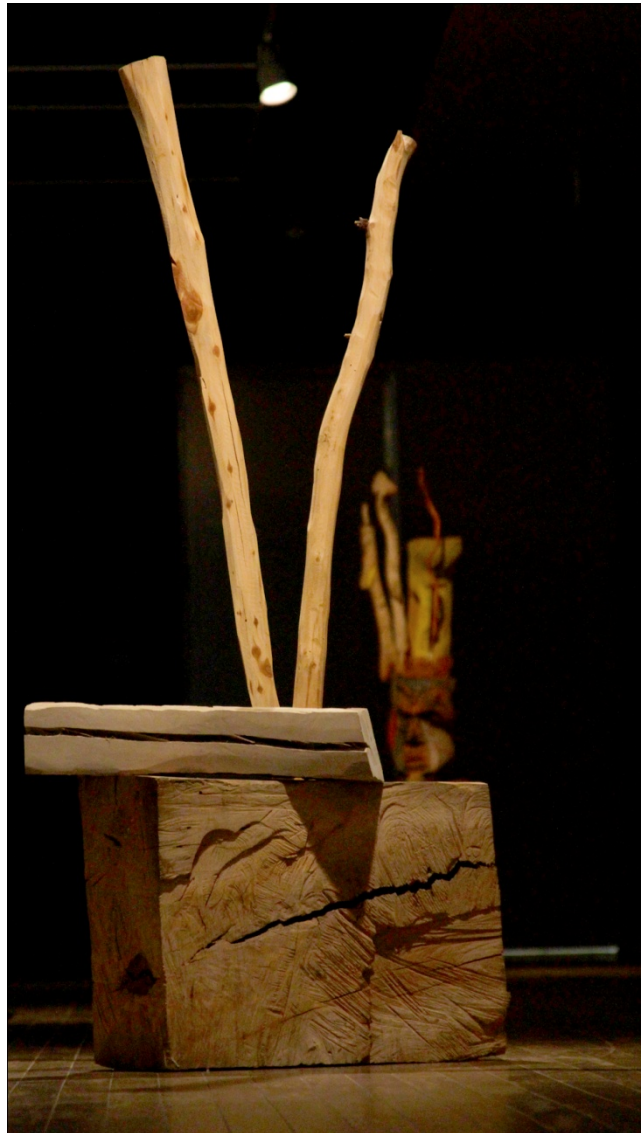
Figure 15 – Jeff Hoffman, A Crack in Everything , 2010

emphasizing the fact that in time change occurs. Whether formed from water evaporating, as in the wood, or expanding as it becomes ice, in which case air – another sightless element necessary for life – is forced under pressure until striations occur.