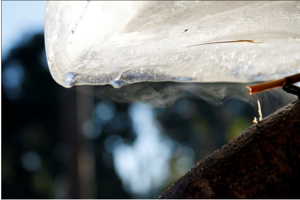
Figure 16 – Jeff Hoffman, Noble Truth , 2012

I strive for my work to be inherently poetic in that there is no beginning, middle, or end. Likewise, there is no fixed story or text to associate it with. I merely assemble a set of circumstances and leave the outcome to chance. Details are not revealed just from further investigation but rather from further reflection. This is enhanced within the composition by drawing the viewer's eye around the piece to gain more information (figure 16).