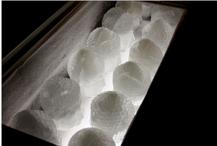
Figure 11 – Jeff Hoffman, Mass Storage , 2012