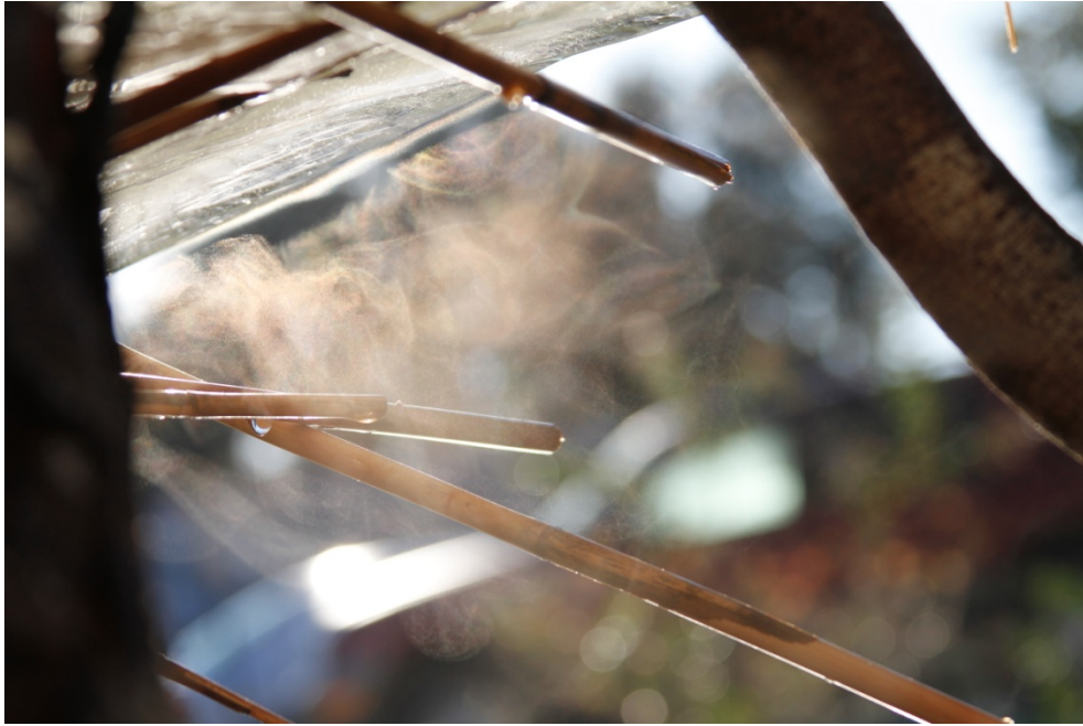
Figure 14 – Jeff Hoffman, Moon in a Dewdrop , 2010

own world to seemingly pause for a moment and allows for the opportunity for contemplation to exist more purely.