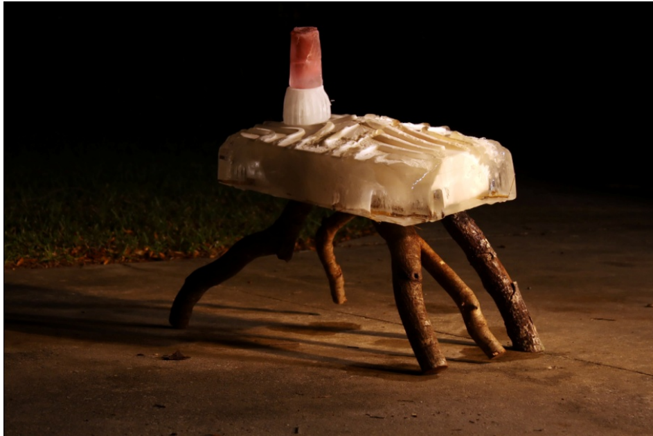
Figure 4 – Jeff Hoffman, Screen Shot from Piñata , 2011