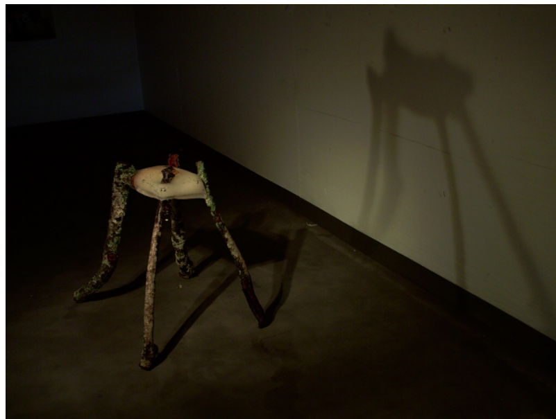
Figure 8 – Jeff Hoffman, Receptual Spider , 2012

In much of my work, ice is combined with wood in a freezer. Here, like cells in any living organism, water molecules act as a bonding agent. When it is frozen, it becomes the bond from which the structural integrity of the sculpture exists. Simply said, it holds everything together. When I construct these composite sculptures, I create legs and a seemingly anatomical structure (figure 8). I play with the analogy of erect Homo sapien entities through their parallels to living creatures, thus adding to the conceptual nature of the form. They are no longer seen merely as ice forms but rather something much more. Or perhaps it is just another layer.