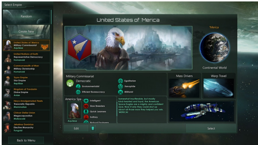
Figure 1. The majestic 'Merican Space Eagles.

The “Animated Aquilese Portraits” mod enhanced my overall experience with the game, making it much more enjoyable and conducive to my gaming needs. I was elated when my Space Eagles colonized a new planet. I was dejected when my empire was wiped out by one of the game’s built-in crises that results in a Game Over unless properly handled. I felt accomplished when I took down an “awakened” fallen empire that perceived me as a threat. I have played Stellaris for 467 hours, and I even shared a playthrough with friends in my only Twitch video to date in part because of this mod. While the mod itself mattered very little in terms of streaming, the mod seemed to impact my confidence because my most successful campaigns involved the ‘Merican Space Eagles.