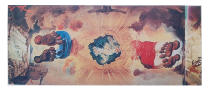
Figure 11 Frescoes of Wind Palace, Dali

The super-realistic and non-logical construction refers to the one transcending the reality and without any concrete realities, and thus the picture reveals an inexplicable and uncertain time-space. The super-realistic and non-logical construction will "reveal the inner mood and sense of being of creation subject through various wonderful arrangement and combination of images" (Xie, 1987, p.34). The pictures usually possess atmosphere of dream and fantasy.