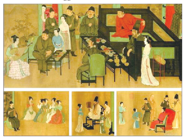
Figure3 The Night Revels of Han Xizai, Gu Hongzhong