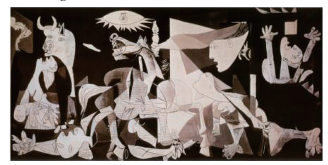
Figure 7 Guernica, Picasso