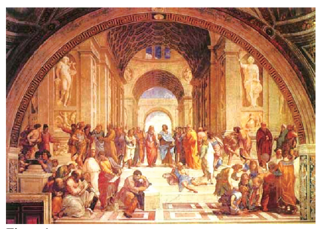
Figure1 The School of Athens, Raphael Santi

multi-dimensional characteristic, and the time may be a combination of the past, the present and the future, and a continuum of time where the incident happens as well. The space of fresco may not only involve the three traditional dimensions of easel painting, but also combines the spiritual space of painters, either the space in reality that seem to impossibly appear simultaneously or the unreal space like imagined space and dreamed space.