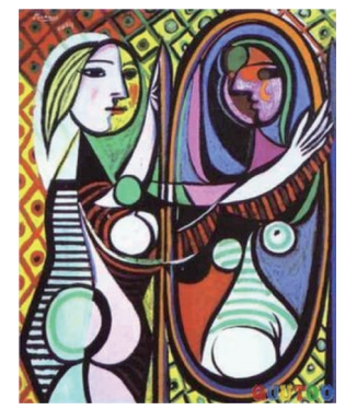
Figure 8 Girl Before a Mirror, Picasso