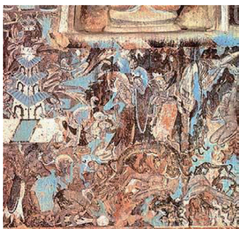
Figure 5 Prince Mahāsattva Sacrificed His Body to Feed the Tiger, Dunhuang fresco