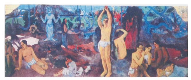
Figure 6 Where Do We Come From? What Are We? Where Are We Going?

fleeting and short life (Li, 1999, p.270). From Confucius's "The Master standing by a stream, said, "It passes on just like this, not ceasing day or night!" to Hawking's black holes nowadays, the consciousness of questioning that how to seek infinite significance of life within finite time and space and to achieve eternal always puzzles the people from generation to generation. Gauguin's picture applies the romantic symbolism, symbolizing the process of one's life with different stages of the people. The religious statue in the left-rear section of picture implies the confusion of Gauguin on faith. Gauguin was always seeking for the meaning of life throughout his lifetime, and went to the primitive and beautiful Tahiti Island later in his life, where he found plain and savageness of human nature vet not found the value of life in his mind at last, and died from depression. Such confusion on faith of Gauguin also reflects the faith collapse of a batch of people of an era. What on earth is the pursuit of life after breaking the traditional aesthetic idea and values?