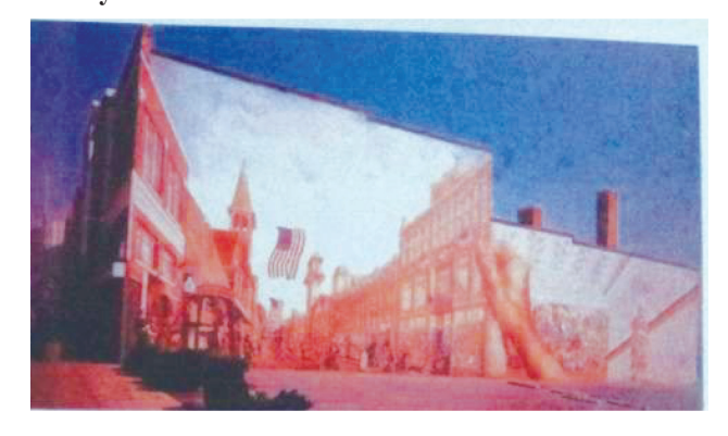
Figure 15 Washington street fresco in the USA