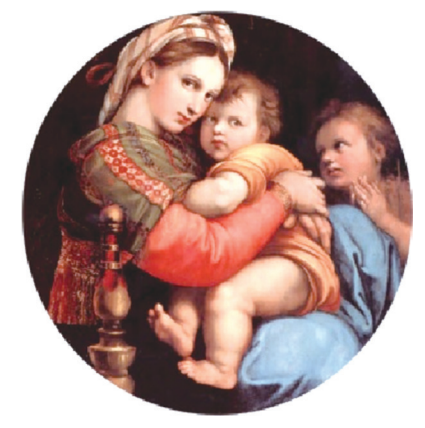
Figure 2 Madonna Della Seggiola