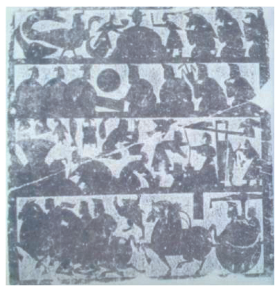
Figure 10 Offer Fruits of Three-plant Trees as Tribute, Han dynasty stone portrait