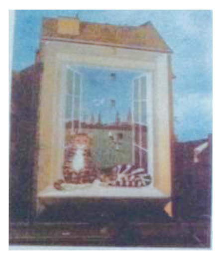
Figure 14 Cat by Lake Alster

Miró's The Wall of the Sun and The Wall of the Moon , and the Berlin Wall of Germany all are masterpieces of creating cultural atmosphere.