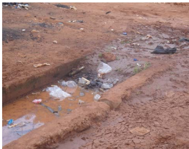
Plate 2: Blocked Drainage Along Old Egume Road

Another impact is that blocked drainage channels ooze out odours, which is offensive to human beings. This is aside the fact that they eventually amass into stagnant pools of water, which become unnecessary breeding grounds for mosquitoes, thereby causing malaria. Infact, it is dangerous for drainage channels to be blocked because it is a cause of accident for both pedestrians and okada riders that are not aware that it is a 'false ground'; and may end up falling into them.