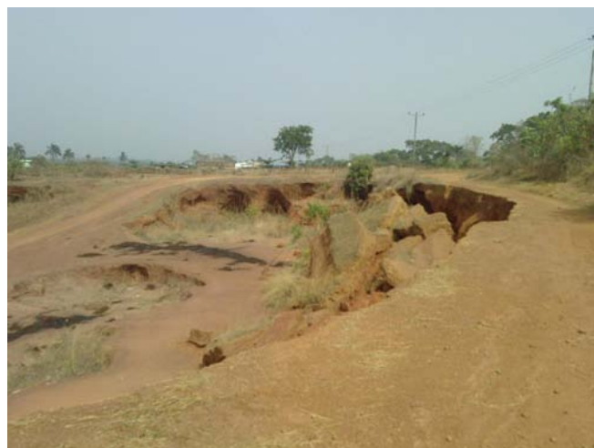
Plate 1: Erosion site in Anyigba, Nigeria

One serious consequence of soil erosion is that it leads to infertility and weakening of soil structure, which in turn; causes depletion of plant nutrients and loss of top soil layer. It can also cause severe damage to roads, irrigation canals and erected buildings and infrastructural facilities. Other impacts include exposure to direct insolation, leaching and general loss of soil nutrients.