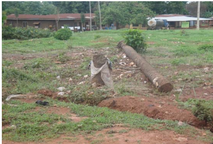
Plate 3: Cutting of Trees for Building Purpose

Deforestation can lead to soil erosion, reduction of soil cohesion, biodiversity loss and desertification. In extreme cases, landslides and even drought occur. Increase in global warming is another devastating impact of deforestation. In Anyigba, a noticeable impact is that daily temperature has increased.