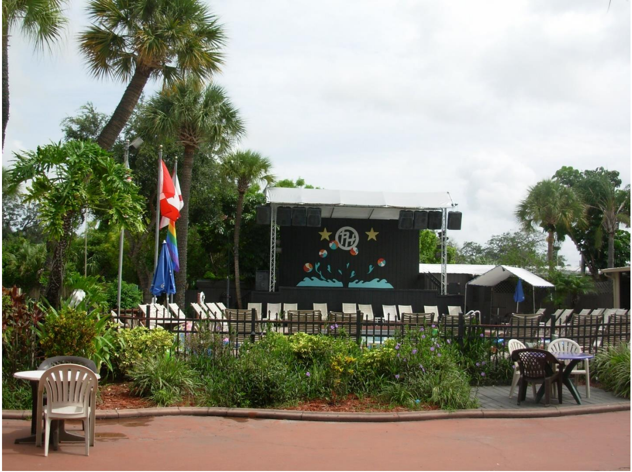
Figure 24 Parliament House Pool and Stage, 2017