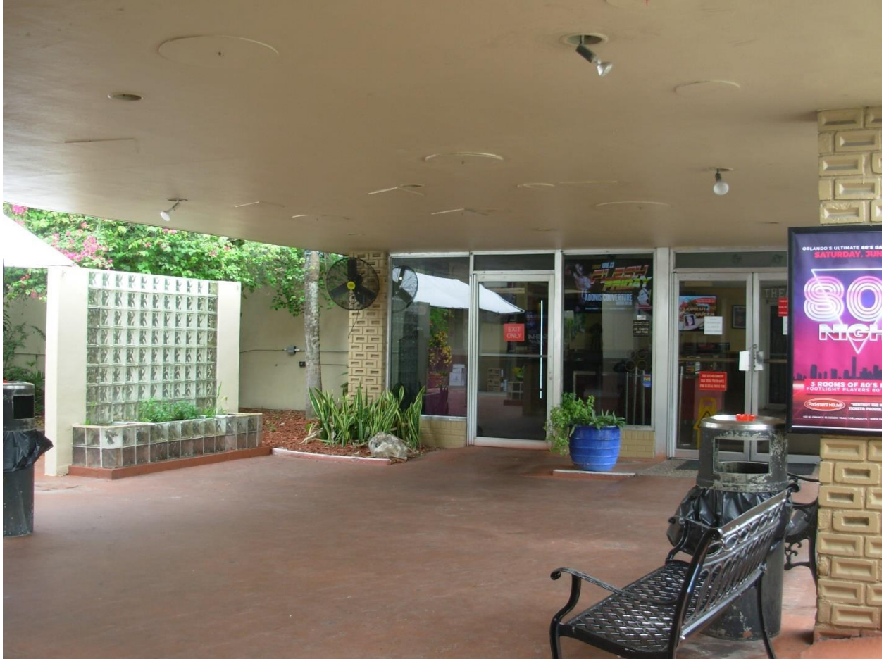
Figure 20 Footlight Theater, Club entrance, southern elevation, 2017