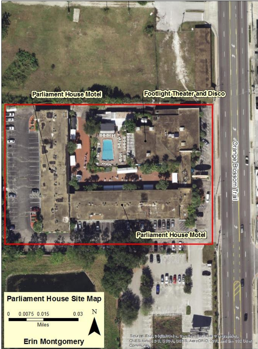
Figure 2 Parliament House Site Map