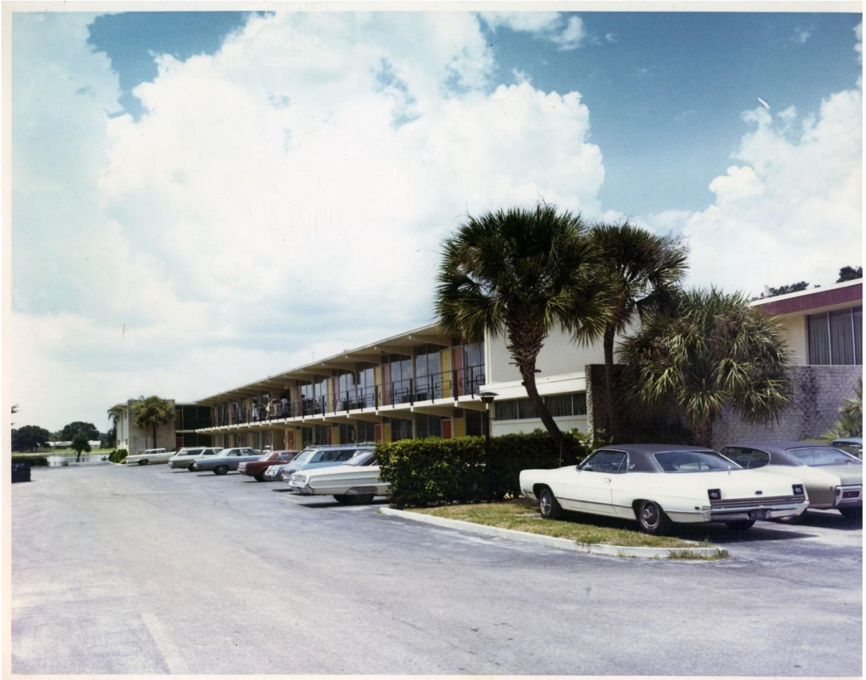
Figure 5 Parliament House 1968