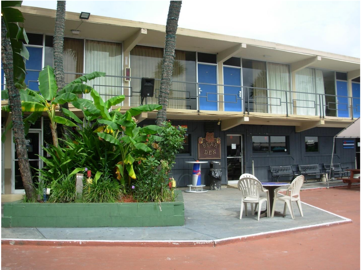
Figure 13 Parliament House Bear Den, eastern elevation, 2017