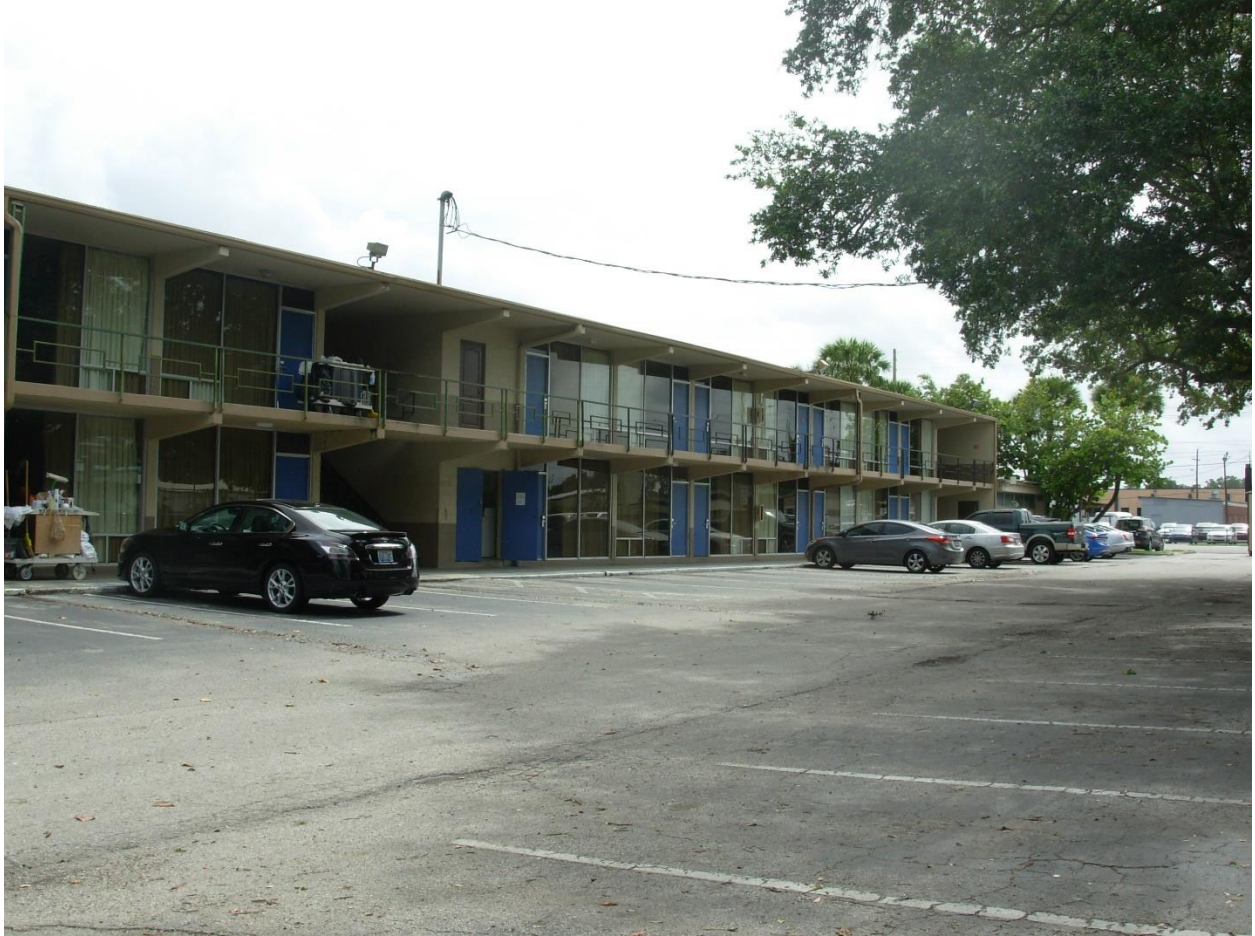
Figure 19 Parliament House southern elevation, 2017