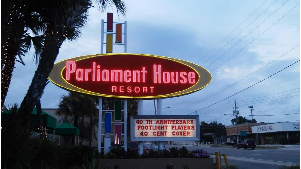
Figure 8 Parliament House Sign, 2015