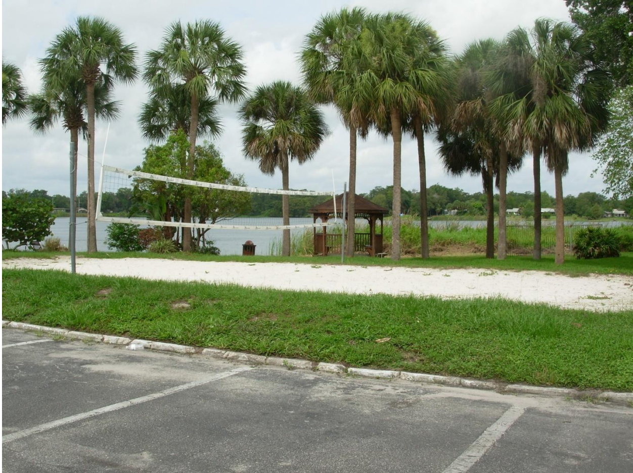
Figure 25 Rock Lake beach area, 2017

Paperwork Reduction Act Statement: This information is being collected for applications to the National Register of Historic Places to nominate properties for listing or determine eligibility for listing, to list properties, and to amend existing listings. Response to this request is required to obtain a benefit in accordance with the National Historic Preservation Act, as amended (16 U.S.C.460 et seq.).