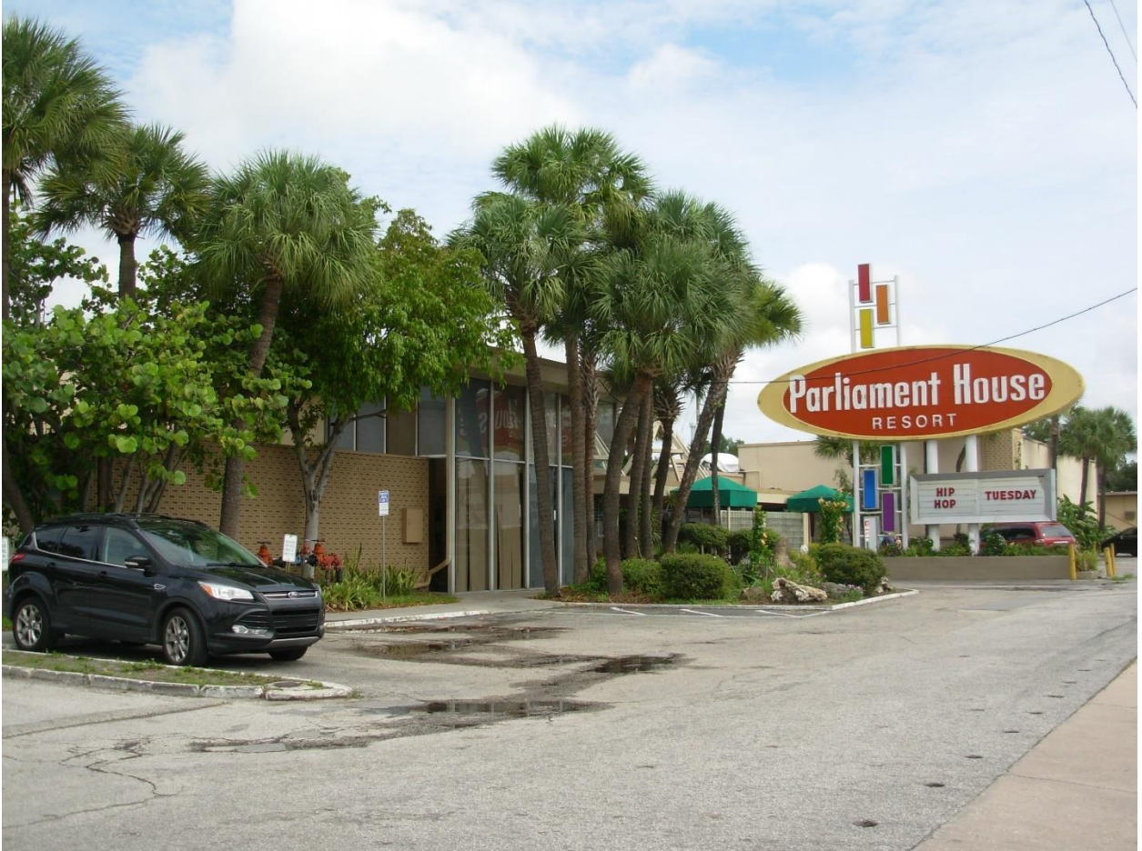
Figure 9 Parliament House façade, 2017