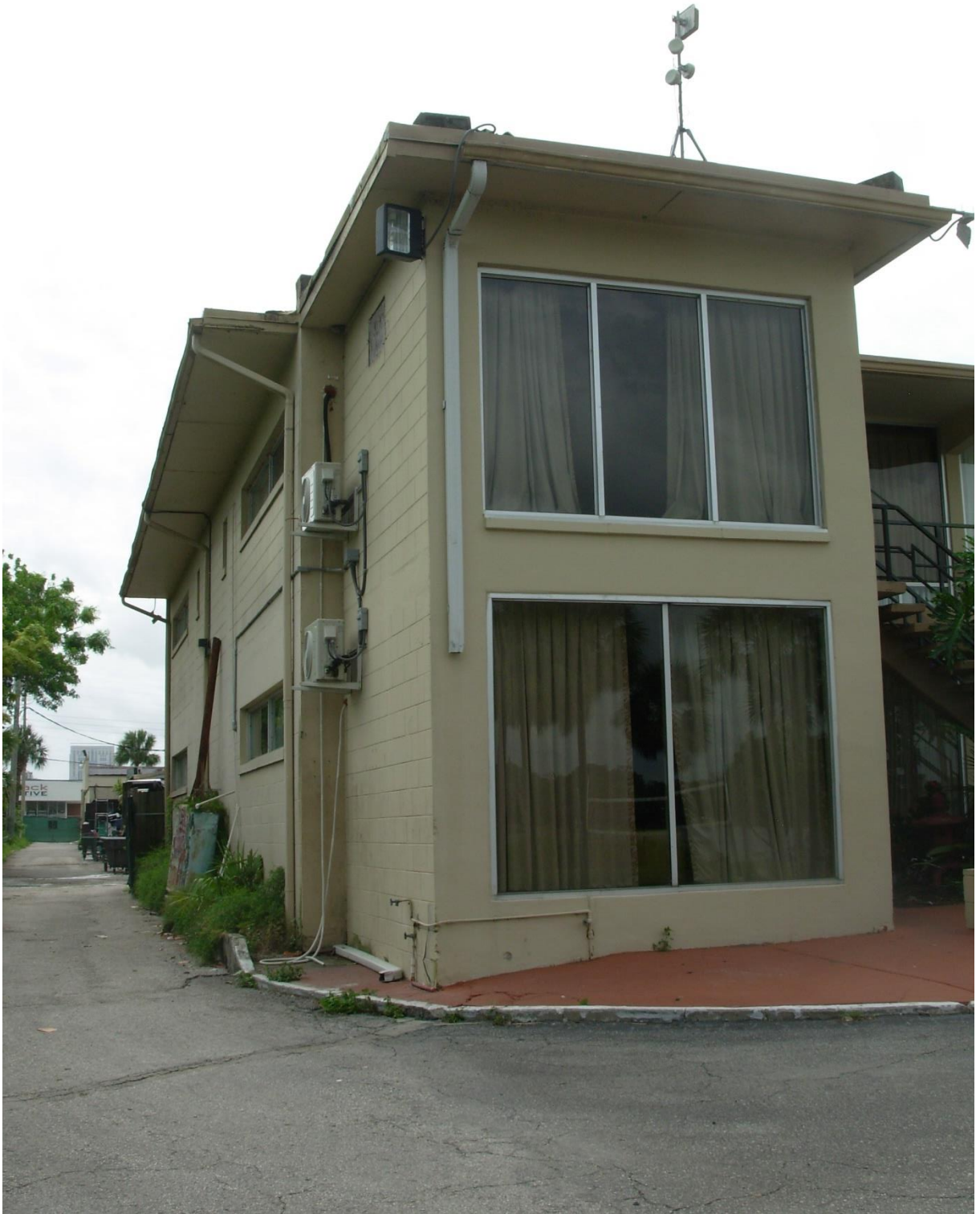
Figure 16 Parliament House northwest corner, 2017