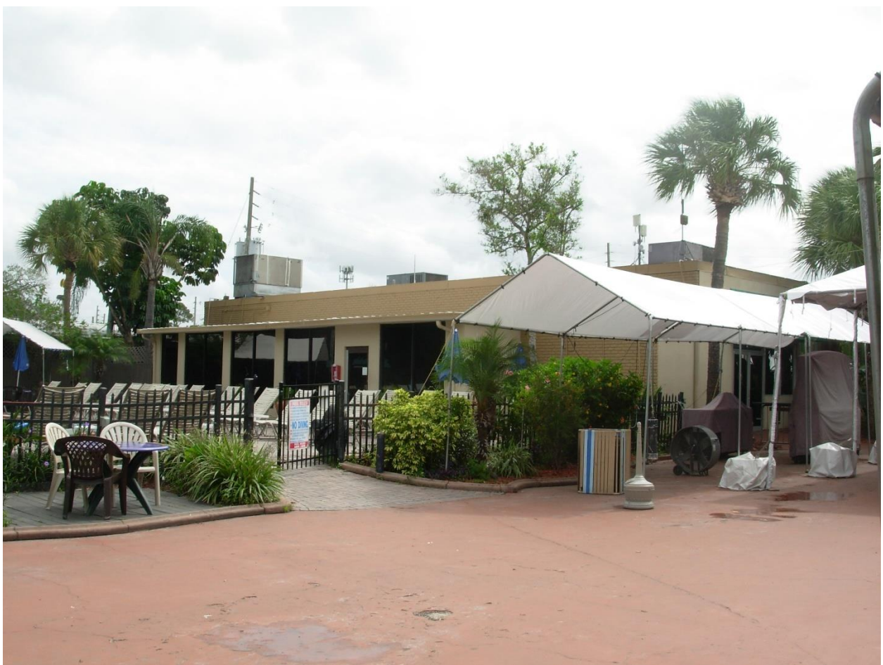
Figure 21 Footlight Theater, Club, southwest corner, 2017