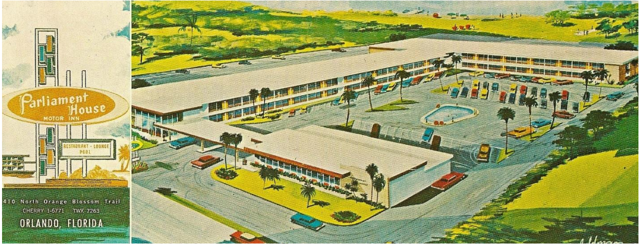
Figure 3 Parliament House Illustration, courtesy of GLBT History Museum of Central Florida