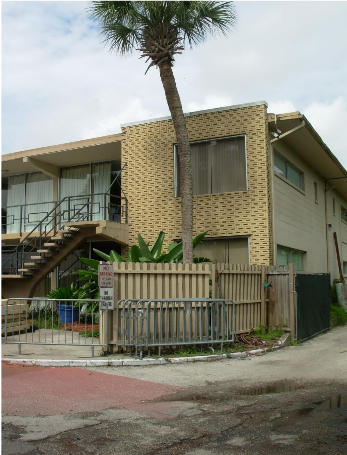
Figure 15 Parliament House northeast corner, 2017