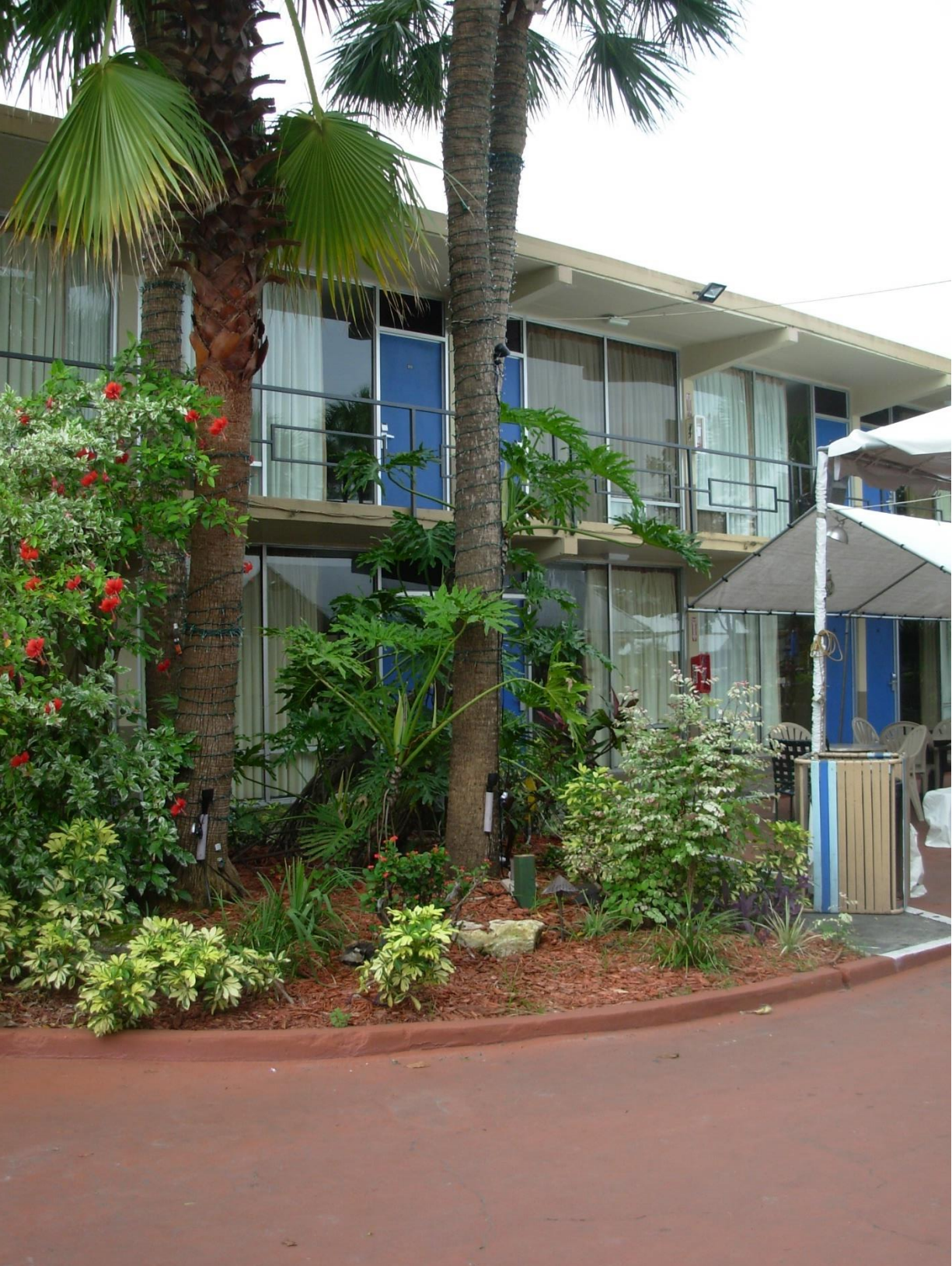
Figure 11 Parliament House Courtyard, northern elevation, 2017