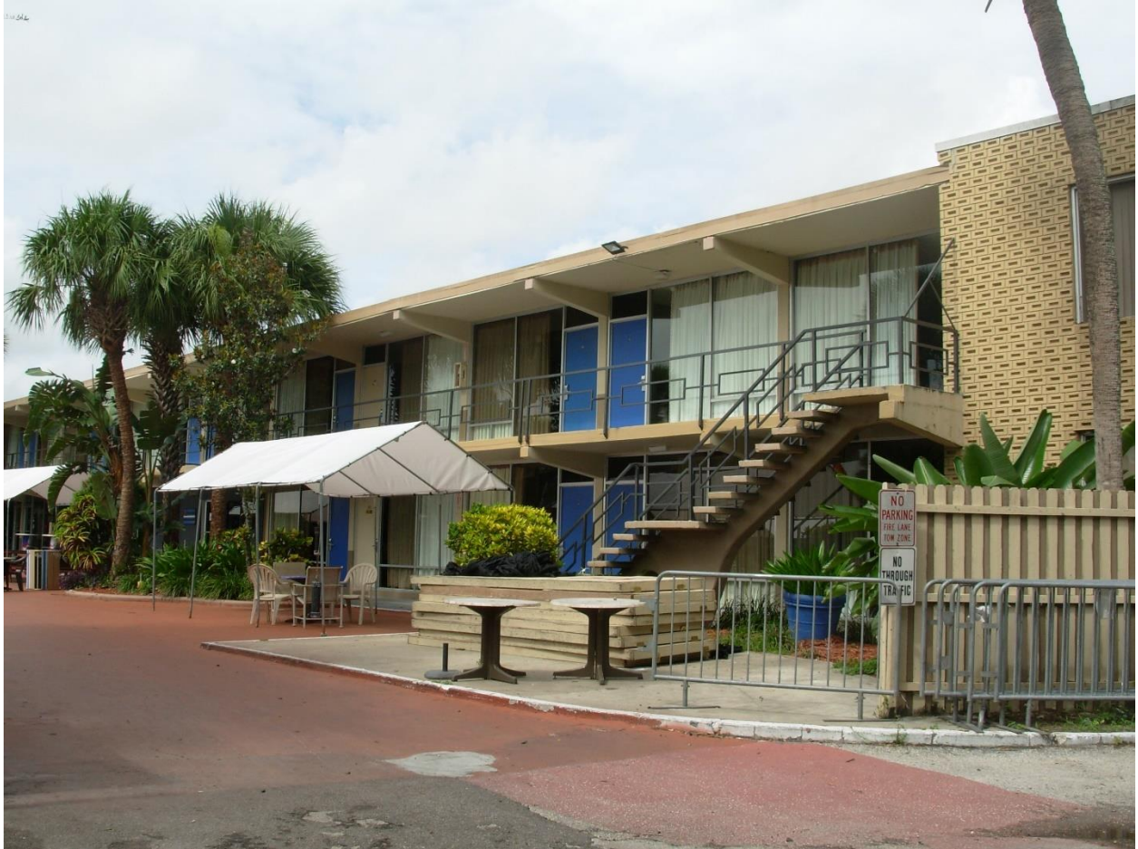
Figure 14 Parliament House eastern elevation, 2017