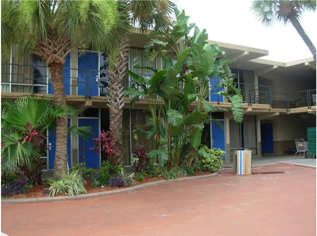
Figure 12 Parliament House northern elevation, 2017