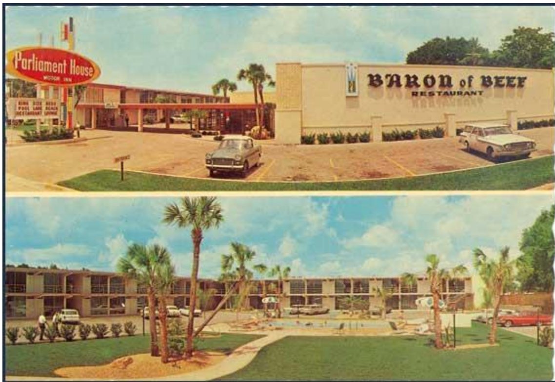
Figure 4 Parliament House Postcard