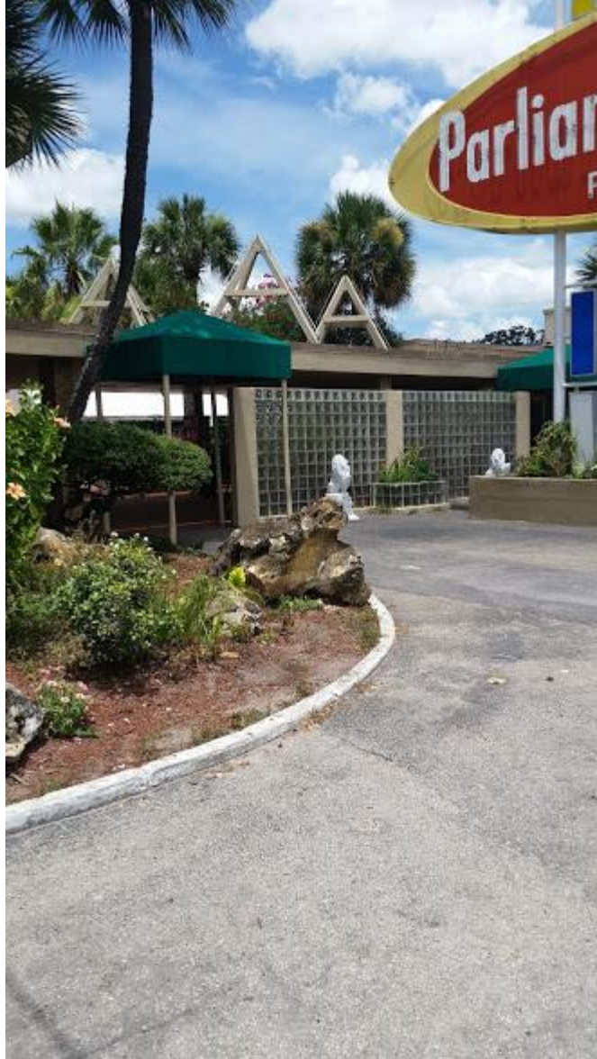
Figure 10 Parliament House Facade, 2017