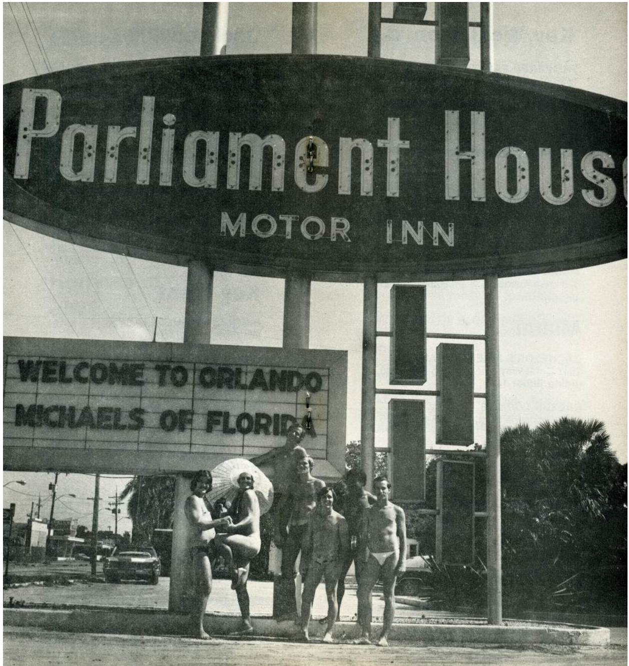
Figure 7 Parliament House Sign ca. 1975, courtesy of GLBT History Museum of Central Florida