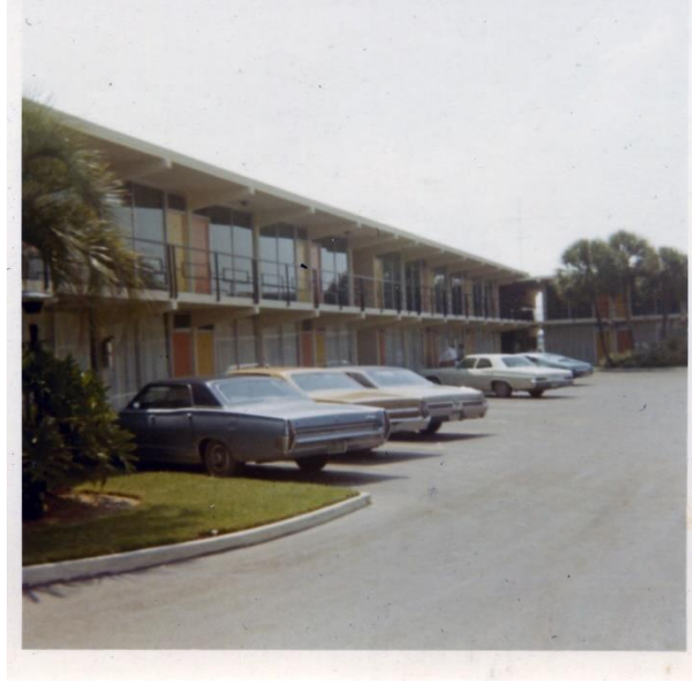
Figure 6 Parliament House 1969