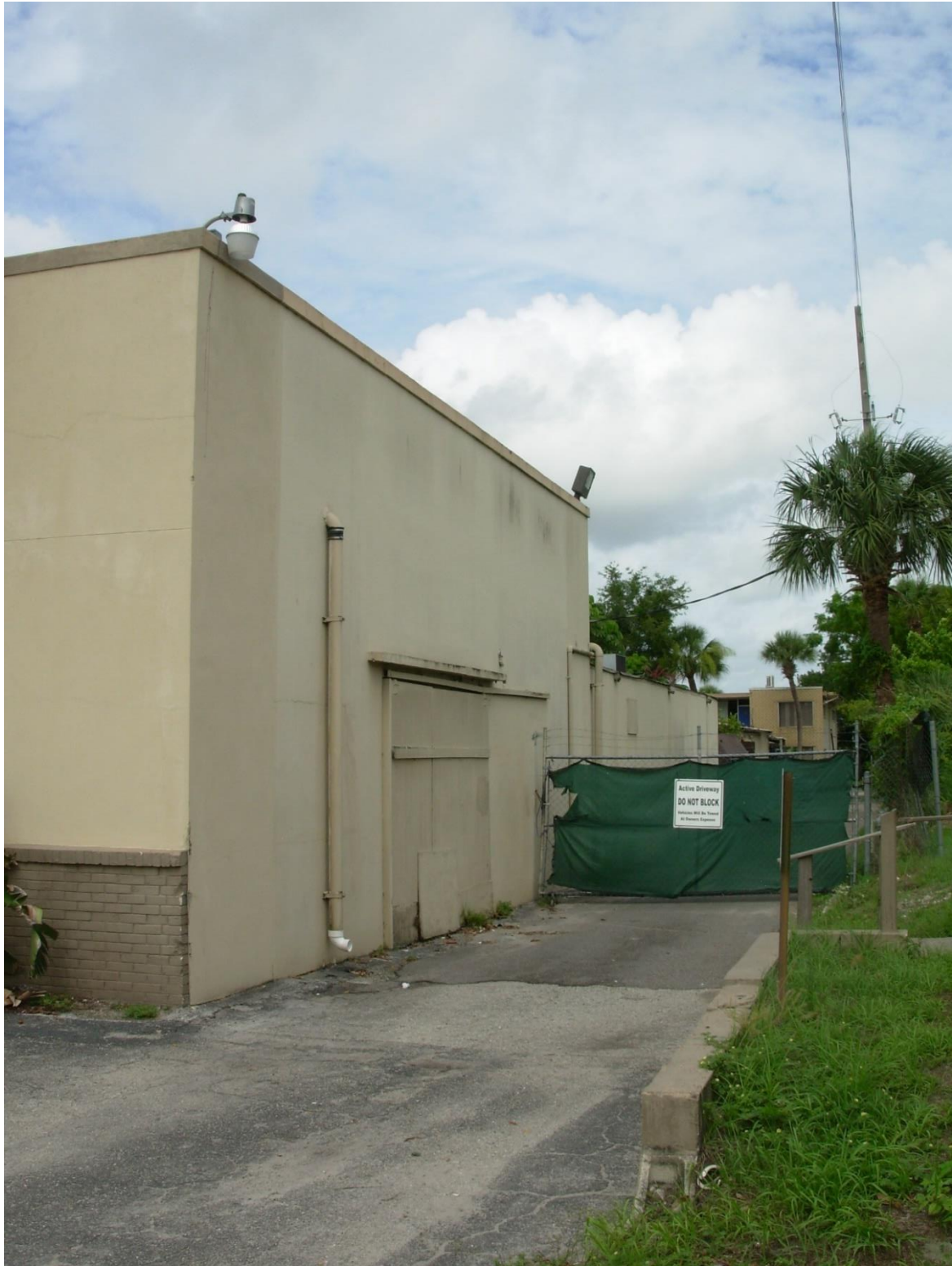
Figure 23 Footlight Theater, Club, northeast corner, 2017