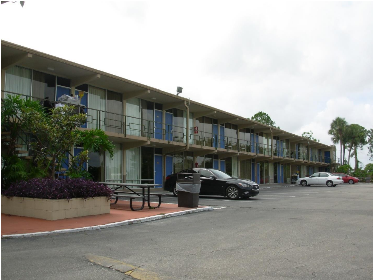
Figure 17 Parliament House western elevation, 2017