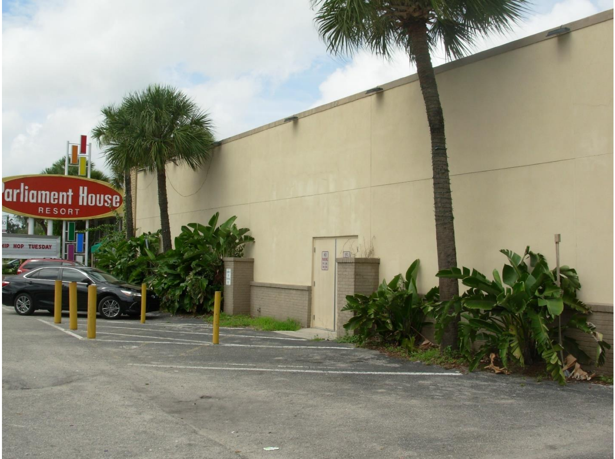
Figure 22 Footlight Theater, Club, eastern elevation, 2017