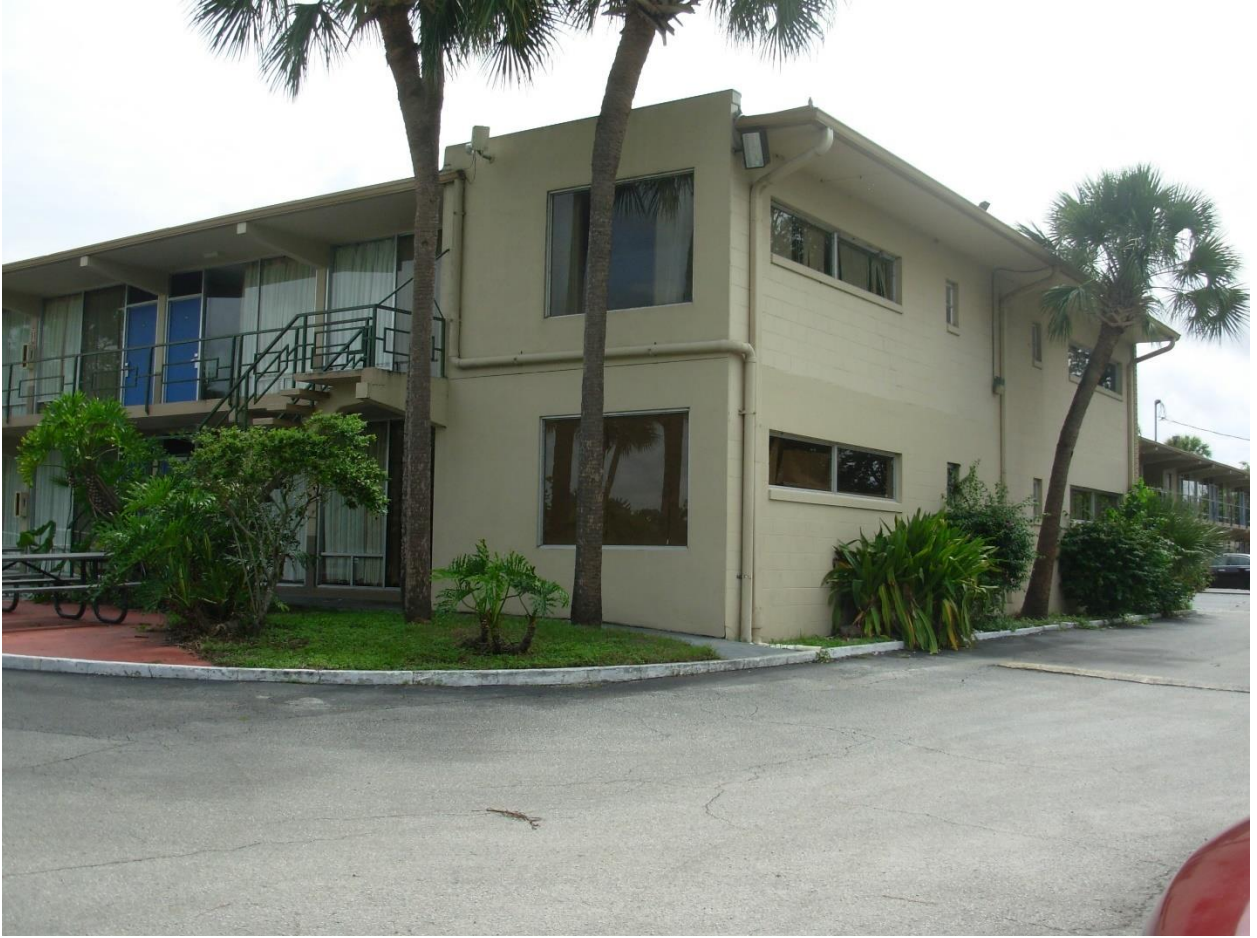
Figure 18 Parliament House southwest corner, 2017