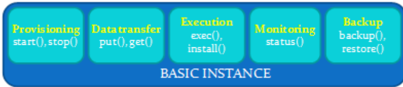
Figure 1. Basic instance functionalities

The abstraction layer relies on the object-oriented approach to abstract computing resources. The resource is represented as an object where all information related to the resource is encapsulated as data members of the object. In this way, the manipulation with the resource will be done via member methods of the object. For example, assume that a virtual machine in the cloud is represented by an object vm , then starting the machine is done by vm.start() , uploading data/application code to the machine is done by vm.upload(data) , execution of a program on the machine is done by vm.execute(command-line) , and so on. More importantly, developers can concretise and add more details to resource description using derived class and inheritance. They also can define what users can do with cloud application via methods of abstract objects. Within commands, default values will be used whenever possible. Sometime, the users only want to create a virtual machine for running their applications; they do not care about concrete Linux flavour, or which key pair should be used. The interface should not force users to specify every parameter even if the users do not care about it. Abstraction layer also make space for resource optimization. The optimization can decide which options are best for users.