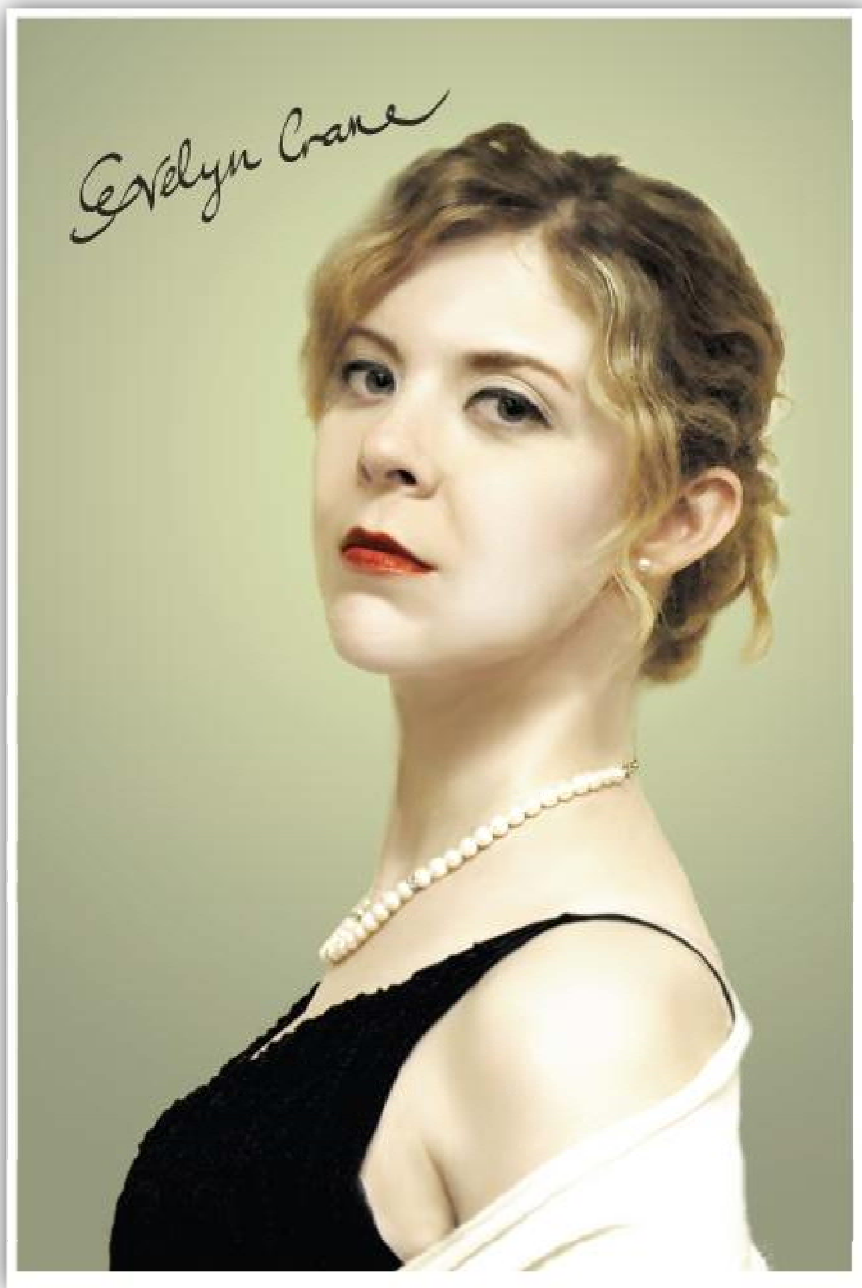
Image 3: Signed copy of Evelyn Crane postcard sent out as rabbit hole.