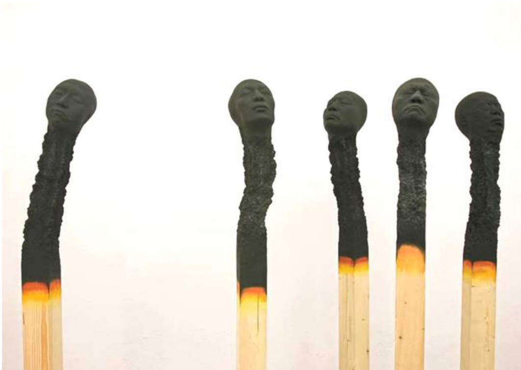
Figure 8 Image from Wolfgang Stiller's series Matchstickmen 55 Displayed March 8 th to May 11th 2013 at the Python Gallery in Zurich