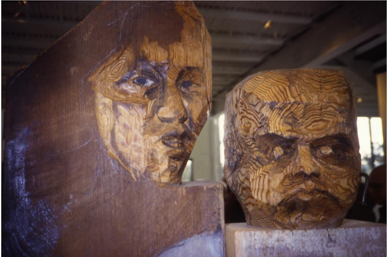
Figure 6 Detail of Woman with Child and Two Lambs , 1995 45