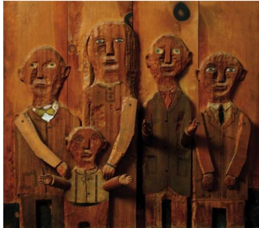
Figure 1 The Large Family Group , 1957

of painting. The family is frontal and shallowly chiseled, with a flatness reminiscent of Egyptian low relief stone carvings.