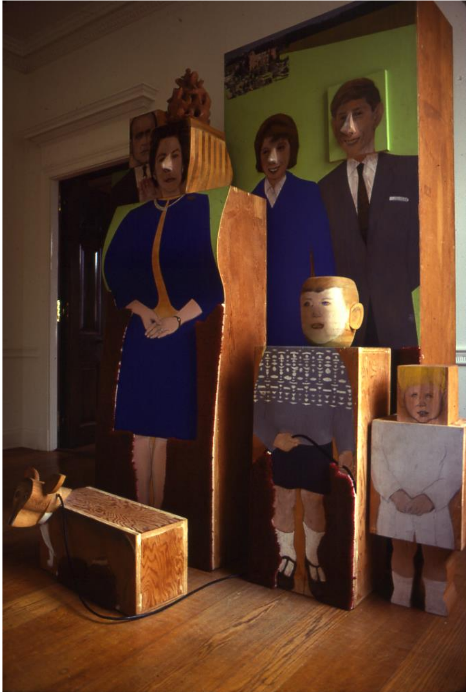
Figure 4 The Royal Family , 1967