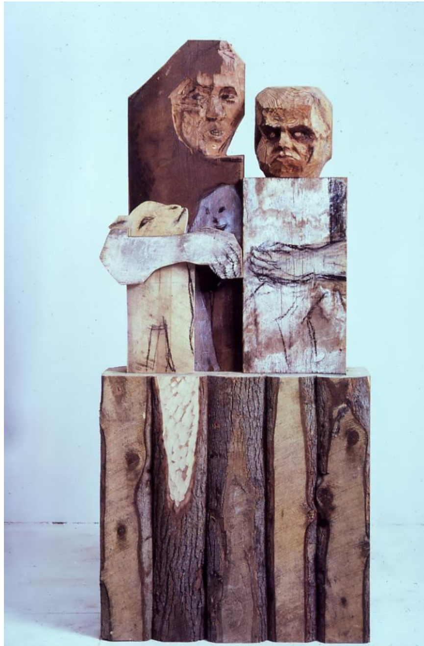
Figure 5 Woman with Child and Two Lambs , 1995 44