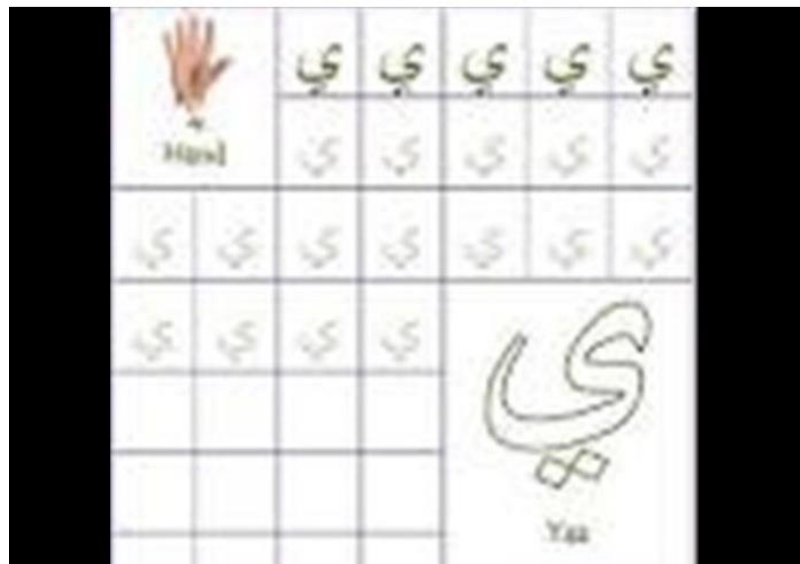
Figure 2: Arabic Alphabet Worksheet

The majority of clip art and images used by the pre-service teachers had English words. There were not as many with Arabic words. The participants also used clip art of worksheets of Arabic letters as well as of the English alphabet to illustrate how they learned to read and write both languages. Pre-service teachers were very careful to make sure their images and photos matched the stories they told.