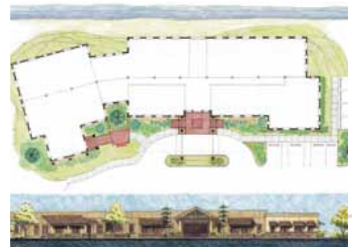
St. Cloud/Osceola County Incubator

Program and its community partners is to facilitate smarter, faster startup and growth of emerging companies so those companies will become financially successful, high-growth companies in the community. For more information, visit www.incubator.ucf.edu .