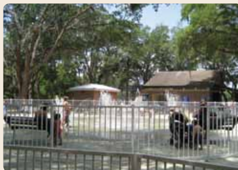
Opening of Splash Playground at Trotwood Park