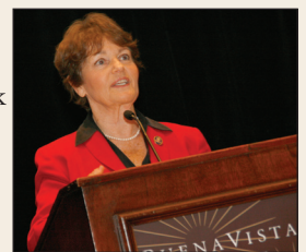
Rep. Suzanne Kosmas addresses attendees at the NBIA Conference with news of her proposed legislation.

The Early-Stage Grant Program established by this legislation will provide grants for incubators that support the