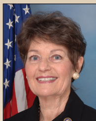
Rep. Suzanne Kosmas

Other elements of Kosmas' plan would eliminate capital gains tax on small business investments, provide a capital gains tax waiver to spur long-term investment in residential and commercial properties, and expand tax credit opportunities for private investment in areas of high unemployment.