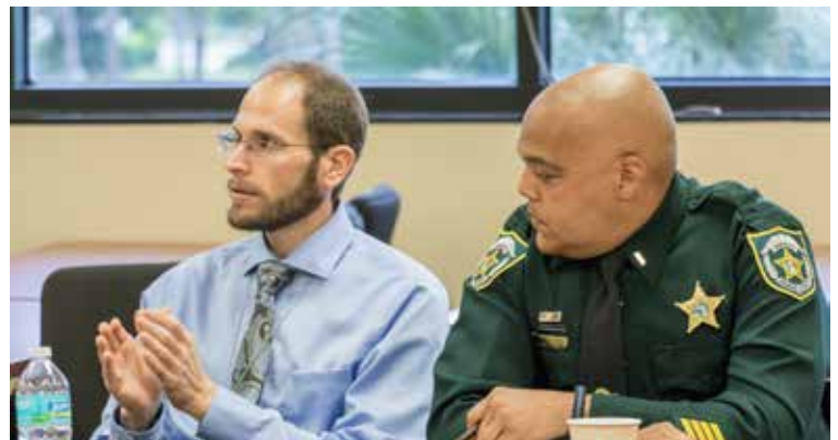
The UCF Business Incubation Program helps facilitate forum for HEAL Global Institute (HGI). HGI is spearheading an effort to promote pre-disaster awareness and preparation in Central Florida.