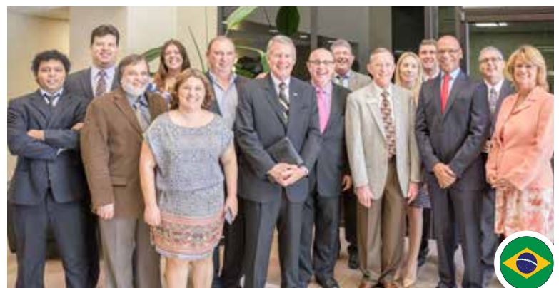
Members of the UCFBIP and ORC team meet with representatives from different countries in an effort to share and collaborate best practices in entrepreneurship initiatives and business incubation.