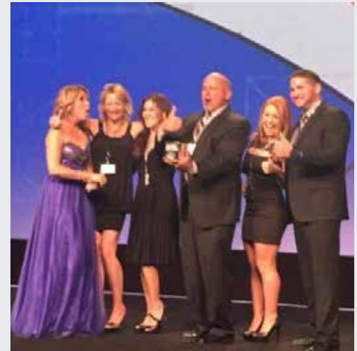
First Response Disaster Team celebrates winning first place honors in the inaugural Bright House Networks Regional Business Awards.

Award categories included startup, small, medium and large business, innovation and newcomer. Winners were selected based on their