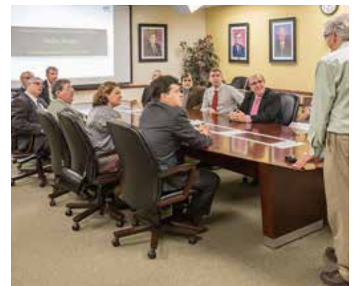
Business leaders from Sao Paulo Brazil gain insights and best practices about the innovation ecosystem within UCF.

Several years ago, members of the UCF Office of Research and Commercialization and