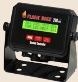
The Flame Boss 200 is compatible with most all of the common smoker units.

Collins, founder and CEO of Flame Boss. "A typical smoking process is 12 to 15 hours and can be a physical and mental drain on the pitmaster as he or she continually monitors the overall smoking process while making the appropriate smoker draft adjustments. We make this process much easier and precise for the pitmaster."