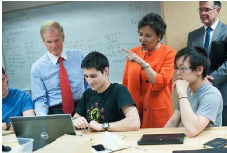
U.S. Sen. Bill Nelson and Secretary of Commerce Penny Pritzker announce funding two initiatives that will advance innovation and capacity-building activities in regions across the country.

i6 Challenge funds The i6 Challenge was launched in 2010 as part of the Startup America Initiative and is now in its fourth iteration. i6 is a national competition that makes small, targeted, high-impact investments to support startup creation, innovation, and commercialization. Now that the i6 Challenge is included in the new Regional Innovation Strategies