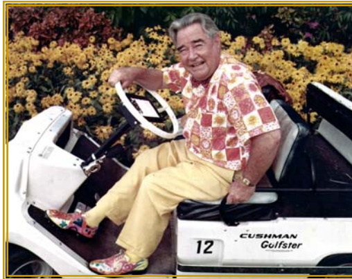
Dick Pope at Cypress Gardens Circa 1970’s.

Pope’s publicity talents helped to build Central Florida into the tourism mecca it is today. Pope utilized the new technologies of photography, and later, film, to capture the beautiful scenery of his park which he sent to newspapers across the nation. Pope called his marketing formula, OPM 2 — ‘Our pictures plus other people’s money squared.’