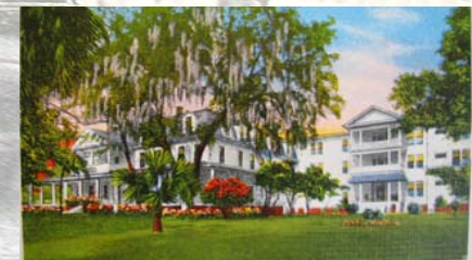
Photo from Angebilt Hotel prospectus depicting view of Downtown Orange Avenue 1929

The few left standing are no longer used as hotels. Fortunately, the Angebilt – Orlando’s first skyscraper when it was built in 1923 by Murray S. King, Florida’s first registered architect— a downtown focus for decades, a spot where glove-clad ladies lunched and couples glided to big band tunes – still stands, restored as home to an engineering company. The old Harley Hotel, a downtown landmark on Washington St. with waterfront views of Lake Eola, was sold off and recently converted to condos.