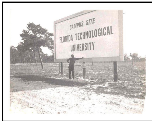
First campus sign.

The University of Central Florida opened its doors to 1,948 students in 1968. Originally developed to support the high-tech workforce needed for the Kennedy Space Center, UCF was originally named Florida Technological University. “Florida Tech”