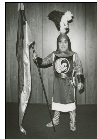
Sir Winsalot made his debut at the Tangerine Bowl. A basketball from the game may be viewed in the exhibit. 1980