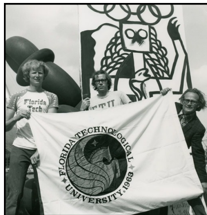
Art faculty at the Olympics in Munich, Germany. 1972