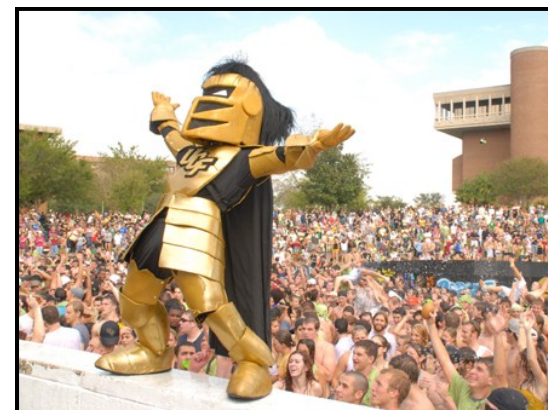
Spirit Splash featuring the current UCF mascot, Knighto.

UCF's annual homecoming game pep rally, the Spirit Splash, has been a school tradition for over 15 years. Historic Spirit Splash photos and commemorative homecoming and Spirit Splash rubber ducks may be viewed in the UCF 50th Anniversary exhibit.