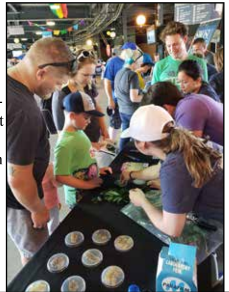
Biology Students helping MVPs with leaf presses.